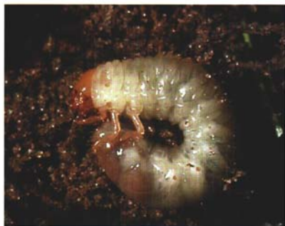
Figure 3. Fully grown third instar grub of Japanese beetle.

Larvae (also known as grubs) are 2 to 3 mm long when newly hatched; fully grown larvae are about 30 mm long (Figure 2). Larvae are C-shaped and white with a brown head capsule and three pairs of legs (Figure 3).