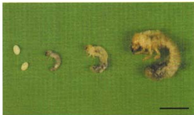
Figure 2. Relative sizes of eggs and first, second and third instar Japanese beetle grubs. Bar = 5mm.

Eggs are 1 to 2 mm in diameter, spherical and white (Figure 2). Females lay batches of eggs 5 to 10 cm below the soil surface, generally in areas with grass and moist soil.