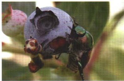
Figure 1. Adult Japanese beetle feeding on ripe blueberry.

Adults are about 13 mm long (Figure 1). The head and thorax are metallic green, and the rest of the upper surface is copper-colored. Five tufts of white hairs on both sides of the lower surface and a sixth pair on the tip of the abdomen are distinguishing