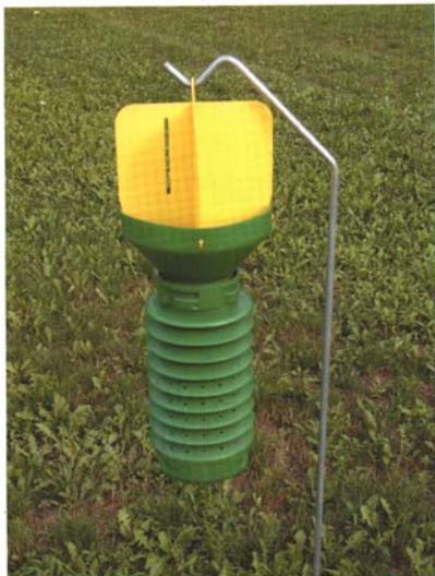
Figure 6. Monitoring trap for Japanese beetle.

Cultural control. One of the most effective control tactics is to make crop fields and nearby areas less suitable for Japanese beetle by integrating many cultural approaches into regular horticultural prac-