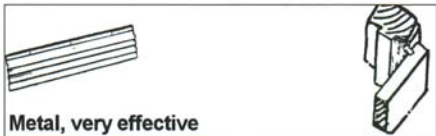
Metal, very effective