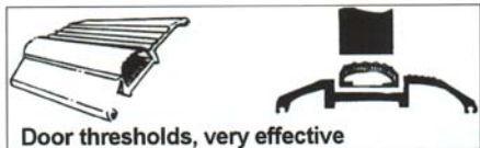
Door thresholds, very effective