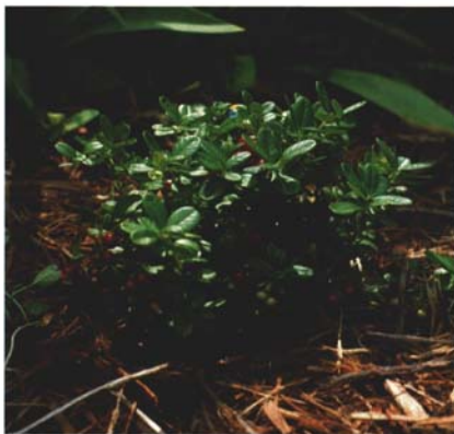
Figure 13. Lingonberry growth habit and fruit.

' Splendor ' - Vigorous growing with moderate plant spread (runnering) and height (6 to 7 inches). Fruits up to 3/8 inch in diameter, brilliant red. Ripens in mid- to late September.