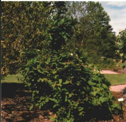
Figure 14. Young medlar tree.

The medlar is a small, self-fertile, deciduous tree that has been cultivated for perhaps 3,000 years. The Greeks and Romans were familiar with it, and the Babylonians and Assyrians may have cultivated medlars. Medlar is closely related to hawthorn ( Crataegus spp.) and pear ( Pyrus spp.). Trees can reach heights of 25 feet but may also occur as large shrubs or form dense thickets (Figure 14). The plants are frequently more broad than they are tall. Wild plants are thorny, but thorns are reduced or lacking in the cultivated forms. Growth rate can be up to 1 foot a year under favorable conditions.