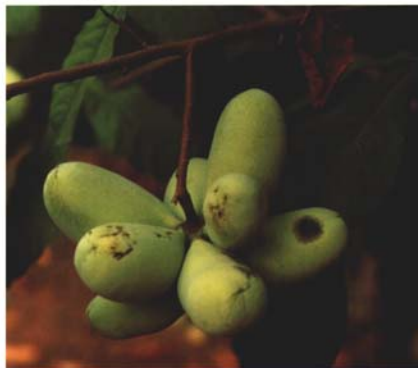
Figure 19. Pawpaw fruit cluster.