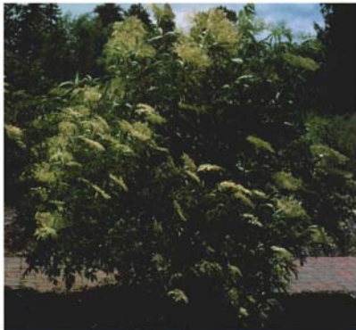
Figure 6. Common elder in full bloom.

Elderberries are fast-growing, spreading shrubs with multiple, pendulous branches (Figure 6). The common elder ( Sambucus canadensis ), the usual cultivated species, is native to much of the Midwest. Height reaches 5 to 12 feet. Fruits are produced in large (4 to 10 inches wide), flat clusters and are purple-black and about 1/4 inch in diameter (Figure 7). They mature in August or September. Some authorities report that people seldom consume the fresh mature fruit; drying or processing is said to increase palatability. Others report that the mature fruits are readily edible. The immature red fruits of all elderberry species should be avoided. Hydrocyanic acid and sambucine are active alkaloids in elderberries that render the immature red fruits toxic.