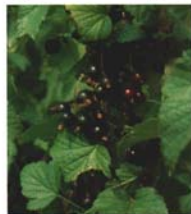
Figure 1. Black currant mature fruit.

Many Ribes serve as alternate hosts for the fungus Cronartium ribicola , which causes white pine blister rust (WPBR), a serious disease of white pine, an important forest and landscape tree. Many states have restricted the cultivation of some types of Ribes , so check with local authorities before purchasing plants. The cultivation of R. nigrum is prohibited in Michigan, but a special permit may be