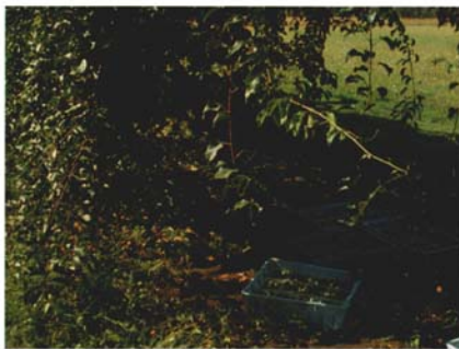
Figure 12. Hardy kiwi vine on trellis.

Actinidias have been cultivated as ornamentals and for their edible fruit. The smooth-skinned fruits can be consumed fresh without peeling. The flavor of hardy kiwi is considered superior to those in the grocery store because of their higher sugar content.