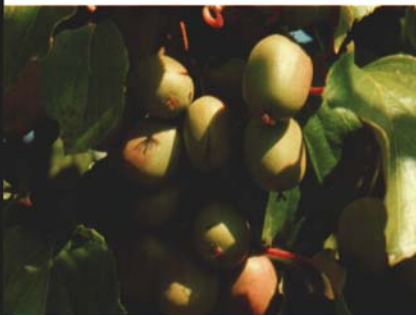
Figure 11. Hardy kiwi fruit.

There are more than 50 species in the genus Actinidia . The two species most suited to Midwest conditions are A. arguta (bower actinidia or hardy kiwifruit) and A. kolomikta ( kolomikta actinidia ). These species produce fruits about the size of grapes (Figure 11). A variant — A. arguta var. purpurea — should also be hardy through much of the Midwest. A. deliciosa , the large-fruited fuzzy kiwifruit, is not hardy enough to grow in the region.