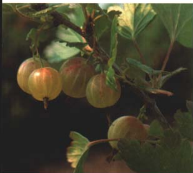
Figure 4. 'Poorman' gooseberries.

Josta - A black currant and American gooseberry hybrid. Plants are tall and thornless, tending not to branch but requiring a lot of space by maturity. Better for home than commercial use. Resistant to gray mold, mildew and WPBR.