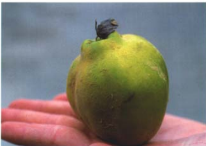
Figure 21. Quince fruit. Note brown pubescence.

quince are yellow or pink and hard and thus not usually recommended for fresh eating (Figure 21). They mature in October and weigh approximately 4 ounces.