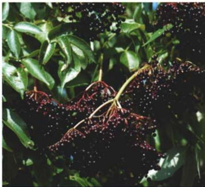
Figure 7. Elderberry fruit clusters.

Best fruit set is achieved by planting several types. The wood of wild elderberries is notably "pithy" and weak. Other elderberry species that can be found in the wild or in the nursery trade in the United States are the blue elder ( S. nigra ssp. canadensis = S. caerulea ), European elder ( S. nigra ), scarlet elder ( S. pubens ) and red elder ( S. racemosa ). Future taxonomic changes are likely for this genus.