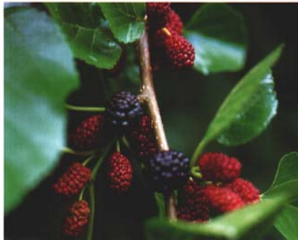
Figure 17. White mulberry fruit.