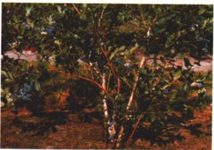
Figure 9. Half-high blueberry cultivar 'Patriot'.