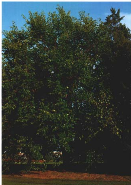
Figure 16. White mulberry tree habit.

var. tatarica - "Russian mulberry": reputedly the hardest of all mulberries.