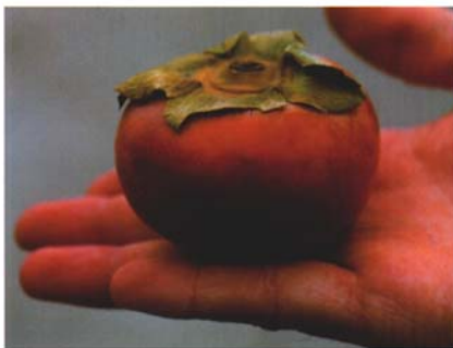
Figure 20. Kaki persimmon fruit.

The fruit is round or oval, reminiscent of some plum cultivars, and variable in size from 1/2 inch diameter to up to 2 inches (Figure 20). The skin is orange to black and usually has a heavy glaucous bloom. Fruit flavor and quality are variable, from good and sweet to flat and insipid. The flesh is usually very pungent and bitter until the fruit is ripe. Fully ripe persimmons lose this astringency. Frost apparently is not required for persimmon fruits to become edible. Numerous selections have been named and introduced, but regional testing of cultivars is limited. Below are some good choices for the Midwest.