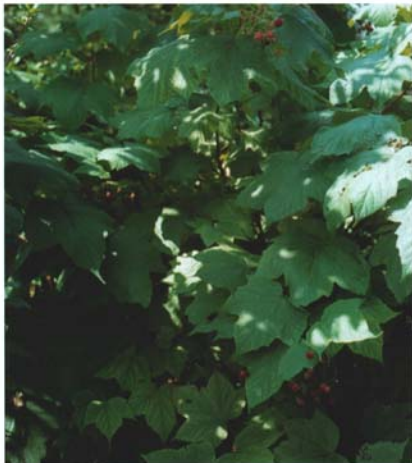
Figure 22. Thimbleberry habit.

Thimbleberry is a short, prostrate or erect deciduous shrub that is a close relative of cultivated raspberries (Figure 22). Typically, the plant grows from 1 1/2 to 8 feet. The canes live an average of 2 to 3 years and develop and fruit like raspberries. Fall color ranges from brilliant orange to maroon. The thimblelike fruit is an aggregate of red or scarlet pubescent drupelets that are dry at maturity and crumble readily when picked (Figure 23). Thimbleberry spreads vigorously through rhizomes and can form dense clonal thickets. In Michigan, thimbleberry grows wild in the north-