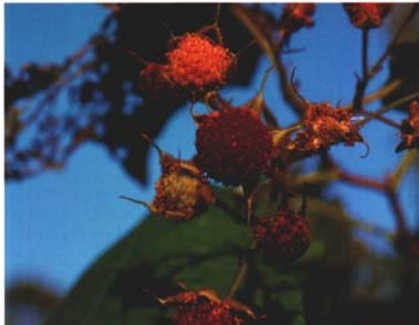
Figure 23. Thimbleberry fruit.

Thimbleberry thrives in a variety of dry to moist and wooded to open sites. The plants tolerate a wide variety of soil