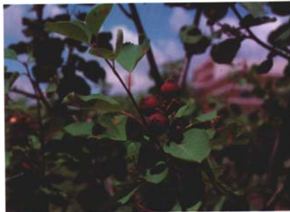
Figure 10. Saskatoon fruit.