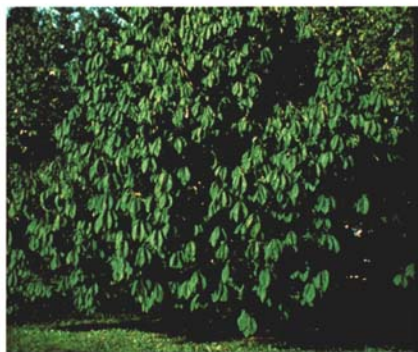
Figure 18. Pawpaw growth habit.

'Convis' - Produces large fruits (to 1 pound) with yellow flesh that mature in Michigan in the first week of October. 'Davis' - Selected from the wild in Michigan in 1959. Fruit are up to 5 inches long and weigh about 4 ounces. They