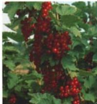
Figure 2. Red currant plant and fruit.