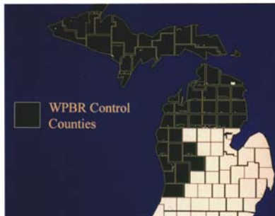
Figure 3. WPBR control area.

granted to grow WPBR-resistant black currant cultivars. In addition, a permit is needed to grow red and white currants and gooseberries within the WPBR control area (most northern counties and several southwestern counties, Figure 3). Again, a permit may be granted to grow WPBR-resistant red and white currants and gooseberries in the control areas. No permit is required to cultivate red and white currants and gooseberries outside of the WPBR con-