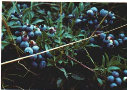
Figure 8. Lowbush blueberry with fruit.

some other Midwestern states. The highbush blueberry is an upright, non-spreading plant that grows 3 to 10 feet tall. The lowbush blueberry is a short (6 to 24 inches), spreading shrub found in many northern forests (Figure 8). Highbush and lowbush fruits are borne in clusters, have inconspicuous seeds, and vary in size and color. "Half-high" cultivars have been developed by hybridizing highbush and lowbush blueberries (Figure 9).