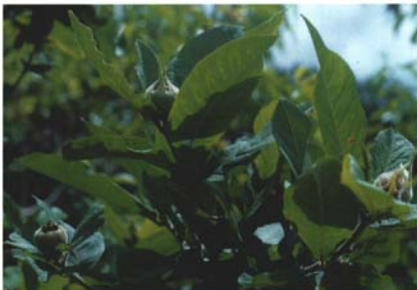
Figure 15. Medlar fruit: drupe or pome?

Medlars produce white to blush-pink flowers on spurs in the spring. The fruit has been variously described as a berry, a "turbinate" berry, a drupe, a haw and, most frequently, a pome (Figure 15). Baird and Theiler (1989) feel that it is best termed a drupe because of seed-containing stones. The fruits need to be "bletted" before they are palatable. Bletting involves leaving the fruit on the tree for one or more hard frosts, harvesting and then leaving the fruit in a cool, dark area for up to several weeks before consuming. The bletting process improves palatability by reducing tannin, asparagine and acid levels, increasing the sugar content and softening the fruit. Bletted fruit tastes similar to spiced applesauce and may have a pleasant vinous character.