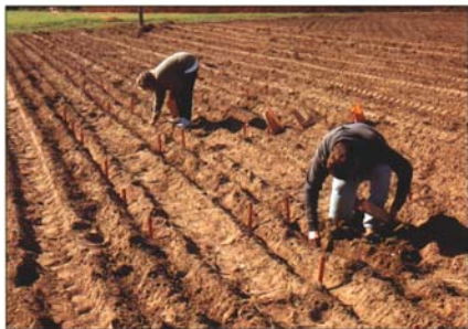
Figure 5. Hand planting garlic cloves.

from 2 to 4 inches deep with the root plate down and the point up (Figure 6). For green garlic production, cloves can be planted closer together and either planted 6 inches deep or planted shallower and mounded up so a significant portion of the stem remains white.