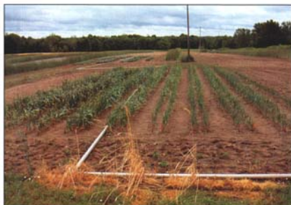
Figure 3. Garlic planted in a double-row system with a spacing of 12 inches between rows and 36 inches between double rows.

Plant spacing depends to a certain degree on available equipment and how it might be adapted to garlic production. Planting schemes range from single rows 40 inches apart to double-row raised beds on 36-inch centers and rows 12 inches apart. In-row spacings range from 1 to 6 inches. Tighter plantings are usually used for garlic grown for processing, where the main interest is in total yield. The fresh market demands a larger bulb, which requires increased between- and in-row spacings to produce. A suggested planting scheme is shown in Figure 3. This shows double rows 36 inches on center with 12 inches between the two rows. An in-row spacing of 4 inches is a good general spacing for most cultivars grown for fresh bulb production. With this spacing, each plant has 1/2 square foot for growth, with a plant population of 87,120 per