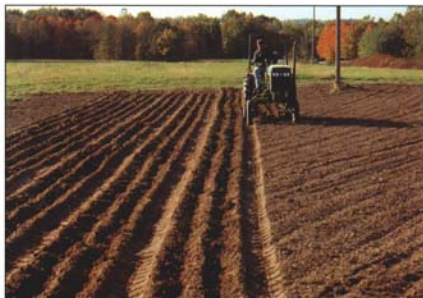
Figure 4. Marking and digging double rows with a cultivator.

For hand planting, rows can be made using cultivators properly spaced and set at the right depth (Figure 4). After planting, the cloves can easily be covered with a hand hoe. The planting process has been mechanized by adapting potato or other planters to handle garlic. However, high-quality fresh garlic is generally hand planted (Figure 5). For bulb production, cloves should be placed