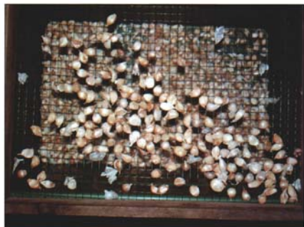
Figure 8. Screen separator (5/8-inch) used to size cloves prior to planting.

size screen tacked to it (Figure 8). Figure 8 shows the use of a 5/8-inch screen which allows cloves with diameters smaller than 5/8 inch to pass through (Figure 9). Other screen sizes can be used to separate out different clove sizes. Cloves too small for planting for bulb production can be eaten or planted for green garlic production.