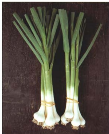
Figure 13. Freshly harvested green garlic prepared for sale.

(Figure 14). Scapes and green garlic are not recognizable by most people because they are not products sold in supermarkets. Some education and free samples may be needed to help market these items.