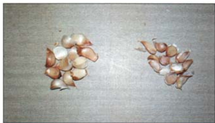
Figure 9. Cloves separated by screening.

Many reports indicate the need for a 2- to 4-inch layer of mulch applied immediately after planting. The purpose of the mulch is to provide winter protection and weed and moisture control. The need for mulch for winter protection is questionable in areas that receive adequate snowfall or have minimal soil freezing during the winter.