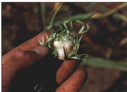
Figure 2. Bulbils produced at the tip of the scape.

Garlic does not flower and produce seeds. Small bulbs (bulbils, Figure 2) are produced at the apex of the scape where flowers would normally be expected to develop. These bulbils are clones of the parent plant and can be planted for production, but garlic is usually propagated by dividing bulbs and planting individual cloves. Each clove produces a clone of the parent plant. Selection of strains by growers has led to the naming of several hundred garlic cultivars. Much sharing of cultivars occurs