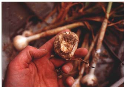
Figure 11. Basal plate rot caused by Fusarium .

The best way to control diseases and insects in garlic is to follow sound rotation practices, plant only clean seed stock and maintain healthy