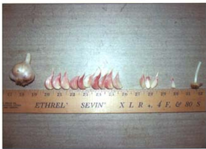
Figure 7. Cloves should be separated and graded into sizes just prior to planting.

be separated into individual cloves (Figure 7). This must be done just prior to planting because separated cloves are more prone to disease and drying out and do not store well. Hand separation is best because it minimizes damage to the cloves and provides an opportunity to inspect cloves for disease problems. For hardneck garlic, the hardest part is to remove the outer skin and the first clove. Once the first clove is removed, others can be removed much easier. Various tools can be used to break through the outer layers of skin to remove the first clove. Be careful not to damage any cloves in the process. Some growers use an air compressor