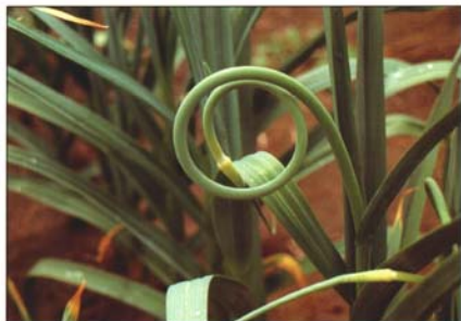
Figure 1. "Flower" stalk or scape produced by hardneck garlic.

The two basic types of garlic are softneck and hardneck. About 30 days after the bulbing process has begun, hardneck garlic will produce a central "flower" stalk (called a scape, Figure 1), much as onions do, except the garlic stalk is solid instead of hollow. Softneck types do not produce this stiff flower stalk and therefore have a soft neck that is more conducive to making garlic braids. Garlic