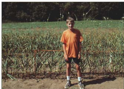
Figure 10. Scapes can reach 5-foot tall and should be removed before they straighten out.

To avoid yield reduction, scapes should be removed. Scapes can be removed by hand either by breaking, cutting or pulling them from the plants. This should be done shortly after emergence but before they straighten out from their curl stage.