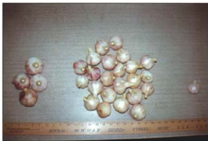
Figure 14. Cleaned and graded bulbs prepared for sale. Left to right: large, medium and small bulbs.

Scapes are ready for harvest when they have completed their circle. Once they start to uncurl, they get fibrous and unusable. Scapes can be used