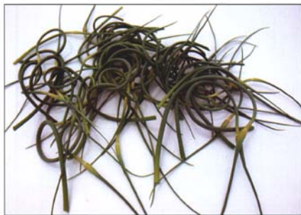
Figure 12. Harvested scapes.

Three products can be harvested from garlic: scapes (Figure 12), green garlic (Figure 13) and bulbs