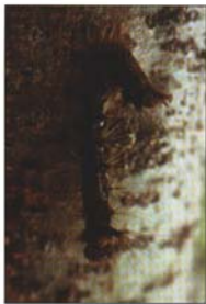
Fig. 13. Gypsy moth caterpillars that die from the NPV disease hang from trees in an upside-down V shape.

Caterpillars killed by the NPV disease hang in an upside-down V shape from trees (Fig. 13). The bodies of the dead caterpillars liquefy (Fig. 14) and rapidly disintegrate. A limited amount of the gypsy moth NPV disease is produced annually and distributed by the state and federal agencies that oversee gypsy moth suppression programs.