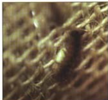
Fig. 11. This gypsy moth cadaver with the white Cotesia melanoscelus cocoon should be left on the burlap band to allow the parasitoid wasp to emerge.

gypsy moth caterpillars (Fig. 10), you should avoid removing any caterpillars with the yellow or white Cotesia melanoscelus cocoons still attached (Fig. 11).