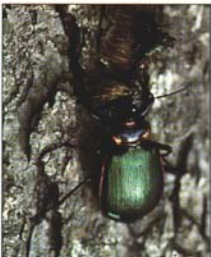
Fig. 3. Calosoma beetles will climb trees to prey on gypsy moth larvae.

Some insects are also important predators of gypsy moth. For example, the Calosoma beetle ( Calosoma sycophanta ) is a "specialist," in that it feeds almost entirely on gypsy moth (Fig. 2). It was introduced into the northeastern United States and, more recently, into Michigan in the Great Lakes region, specifically to help provide long-term control of gypsy moth populations. Adults and larval stages of this brightly colored beetle feed on gypsy moth caterpillars and pupae (Fig. 3).