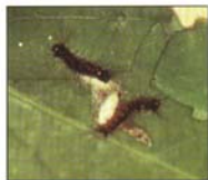
Fig. 9. A white Cotesia melanoscelus cocoon near parasitized gypsy moth caterpillars.

Avoiding applications of broad-spectrum chemical insecticides in early and midsummer will help protect this species. Application of the microbial insecticide B.t.k. may slow the development of gypsy moth caterpillars. This can benefit the Cotesia melanoscelus wasps and may increase the rate of parasitism. If you use burlap "hiding bands" on your trees and then mechanically remove