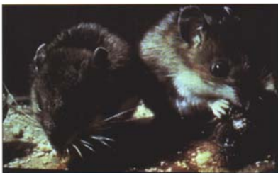
Fig. 1. Mice are important predators of gypsy moth caterpillars and pupae.

Shrews, mice, voles and other small mammals often feed on gypsy moth caterpillars and pupae that they encounter on the ground and around the bases of trees. Mice (Fig. 1) seem to prefer the large female pupae to the smaller male pupae. This selective feeding can have a greater impact on the overall gypsy moth population than random feeding. Chipmunks, skunks and raccoons will also feed on gypsy moth larvae and pupae, and squirrels will feed on pupae.