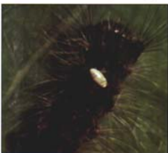
Fig. 5. A parasitoid fly laid the white egg on this gypsy moth caterpillar.

Parasitoid larvae live by feeding on tissues in the body of the host insect, killing it in the process. Once the parasitoid has completed its development, it emerges from the host insect. Several parasitoids are important natural enemies of gypsy moth. A few examples are described here.