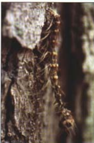
Fig. 16. Gypsy moth caterpillars killed by the Entomophaga maimaiga fungus hang from the tree and are dry and brittle.

Like all fungi, Entomophaga maimaiga is strongly affected by temperature and moisture. Cool, rainy weather in the spring and early summer probably favors the fungus, but the specific conditions needed for good control are not yet known. When conditions are right, however, it can be an important source of mortality in both low and high gypsy moth populations.