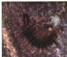
Fig. 12. The reddish brown puparium indicates that this gypsy moth caterpillar was killed by a parasitic fly such as Compsilura coccinmata .

This fly attacks gypsy moth caterpillars, as well as the caterpillars of more than 100 other moth and butterfly species. It was introduced for gypsy moth control many years ago and is well established throughout much of the northeastern and north central United States. It has three generations a year, although only one of these generations attacks gypsy moth caterpillars.