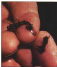
Fig. 14. Caterpillars killed by the NPV pathogen liquefy rapidly.