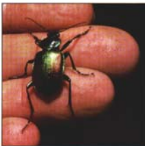
Fig. 2. The adult Calosoma sycophanta beetle is a gypsy moth predator.