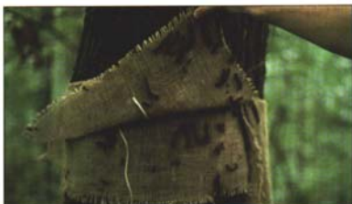
Fig. 10. Gypsy moth caterpillars hide under burlap bands and can be removed.

However, the small wasps sometimes have difficulty attacking larger gypsy moth caterpillars, and the wasp has its own natural enemies that may limit its effectiveness.