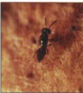
Fig. 6. Ooencyrtus kuvanae is an important egg parasitoid of gypsy moth.

This little wasp is a specialist that parasitizes the eggs of gypsy moth (Fig. 6). It was introduced into the United States for biological control of gypsy moth many years ago and is now well established in most of the region infested by gypsy moth. Three generations of this wasp may occur in the summer and fall after egg masses are laid, and another generation may occur the following spring. The tiny, dark adult wasps can often be observed if you look closely at gypsy moth egg masses. You may also see the small, round holes in the egg mass where the adult wasps emerged (Fig. 7). Because the wasp is small, it can usually attack only the eggs in the upper layer of a gypsy moth egg mass. In many years, however, it is able to kill 20 to 30 percent of the eggs in an egg mass.