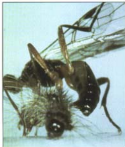
Fig. 8. A Cotesia melanoscelus wasp parasitizes a young gypsy moth caterpillar.