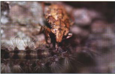
Fig. 4. A predatory stinkbug attacks a gypsy moth caterpillar.

Several native insects are also good predators and will attack gypsy moth, as well as other plant-feeding insects. For example, in Fig. 4, a predatory stinkbug is feeding on a gypsy moth caterpillar. Ants can also be important predators of young caterpillars. Many other insect predators and spiders are opportunistic feeders and will consume gypsy moth larvae or pupae when they are available.