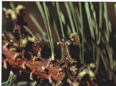
Fig. 5. When disturbed, sawfly larvae may rear their heads in unison to startle potential predators.

As the larvae mature, they consume entire needles down to the papery sheath at the base of the needles. Larger larvae are usually present at about 275 to 500 degree-days, using a base of 50 degrees F. Sawfly larvae are relatively neat feeders — shoots defoliated by sawfly larvae often appear to have had the foliage clipped off with scissors (Fig. 4).