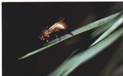
Fig. 6. An adult female sawfly lays one egg into each slit that she cuts into a needle.

Adults live only a few days and do not feed. After mating, an adult female will use her sawlike ovipositor to cut slits into a current-year needle on a pine tree (Fig. 6). This is where the name "sawfly" comes from. One egg is deposited into each slit. There may be 8 to 10 eggs per needle, and often 8 to 12 needles on a shoot will contain eggs (Fig. 7). Eggs overwinter in the needles, where they are well protected from temperature extremes and most predators. The European pine sawfly has only one generation per year.