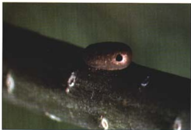
Fig. 10. The small round hole indicates that this cocoon was attacked by a parasitic wasp.

Occasionally, other control methods may be needed. When ornamental pines are infested, you can use the "clip and squish" control method. Simply prune out the colony and destroy the larvae by smashing them or by soaking them for a few days in soapy water. A high-pressure nozzle on a garden hose can be used to knock down colonies that are out of reach.