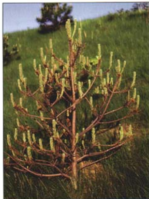
Fig. 8. Defoliation by European sawfly reduces tree vigor but rarely kills the tree because larvae will not feed on current-year foliage.

Trees are rarely killed by the European pine sawfly because the larvae prefer to feed on older foliage and rarely consume current-year needles (Fig. 8). However, moderate or severe defoliation will reduce tree growth. Repeated defoliation will decrease tree vigor and make trees more susceptible to other stresses such as drought or disease. Even relatively light defoliation may affect the appearance of ornamental pines, and light to moderate defoliation can reduce the marketability of pines in Christmas tree plantations. Fortunately, many options exist to control this pest and limit the damage it causes to your trees.