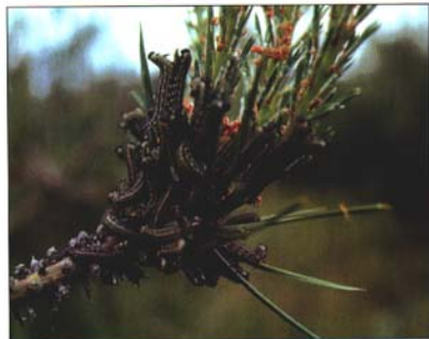
Fig. 1. Larvae of the European pine sawfly usually feed in colonies.

Have you noticed sparse or missing foliage on your pine trees? This may be the work of a defoliating insect called European pine sawfly ( Neodiprion sertifer Geoffroy) (Hymenoptera: Diprionidae). Larvae of the European pine sawfly feed on one- or two-year-old needles of many species of pine, including Scotch, red, jack and mugho pine. As its name implies, this insect is not native to North America. It was discovered in New Jersey in 1925 and is now found from southwestern Ontario through New England and west to Iowa. Many species of native sawflies also feed on pines, spruces and other conifers. European pine sawfly is one of the most common pests of ornamental pines in urban areas, however, and young pines growing in Christmas tree plantations, hedgerows and sometimes forest stands in much of the Great Lakes region. Knowing how to recognize and manage the European pine sawfly will help you protect your pine trees from severe defoliation and damage.