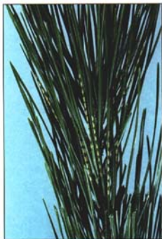
Fig. 7. Needles bearing European pine sawfly eggs.

Adults live only a few days and do not feed. After mating, an adult female will use her sawlike ovipositor to cut slits into a current-year needle on a pine tree (Fig. 6). This is where the name "sawfly" comes from. One egg is deposited into each slit. There may be 8 to 10 eggs per needle, and often 8 to 12 needles on a shoot will contain eggs (Fig. 7). Eggs overwinter in the needles, where they are well protected from temperature extremes and most predators. The European pine sawfly has only one generation per year.