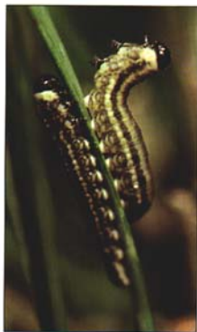
Fig. 3. European pine sawfly larvae have black heads and green stripes.

European pine sawfly larvae are grayish green with a light stripe down the back and a dark green stripe along each side (Fig. 3). As the larvae mature and grow, these stripes may break up into spots. Larvae have shiny black heads and are up to 1 inch long when they complete their feeding.