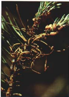
Fig. 4. Young larvae skeletonize needles, leaving dry, strawlike needle remains. Older larvae consume entire needles down to the base.

usually between early April and mid-May. This timing usually corresponds with an accumulation of 100 to 200 degree-days, using a base of 50 degrees F. Colonies of the young larvae feed along the edges of needles that are one or two years old and avoid feeding on the main veins of the needles. The dry, strawlike tufts that remain behind the current year foliage are characteristic of European pine sawfly feeding (Fig. 4).