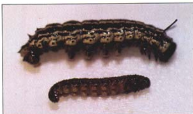
Fig. 2. Sawfly larvae (bottom) have 6 to 8 pair of fleshy prolegs; caterpillars such as the orange-striped oakworm (top) have no more than 5 pair of prolegs, and some segments of the body have no prolegs.