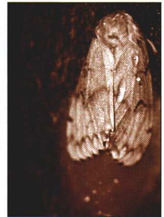
Female gypsy moth and egg mass

Nope — gypsy moth is here to stay and is now a part of Michigan's forest and urban forest ecosystems. But you can help keep gypsy moth from spreading into new areas that are not yet infested. Gypsy moth females like to lay their egg masses in dark, protected locations such as the undersides of lawn chairs or picnic tables or on firewood. Egg masses may also be found on recreational vehicles or trailers or in the wheel wells of cars.