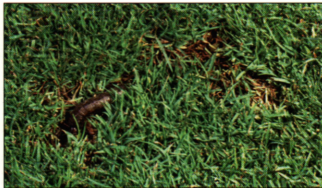
Fig. 1. Damage caused by black cutworms

Injury: Black cutworms dig burrows into the thatch or the soil of a golf course green. They emerge at night to feed on the roots and shoots of grass plants. Their feeding damage resembles ball marks on golf greens—round or depressed spots of dead turf (Fig. 1). The caterpillars often use aeration holes for burrows, but aerated greens do not have more black cutworm damage than greens that are not aerated.