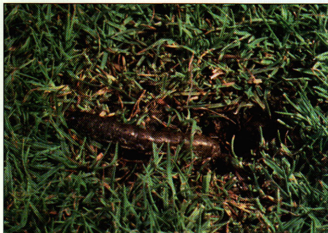
Fig. 3. Black cutworm caterpillar

Description: Larvae are hairless caterpillars with markings on the head and body (Fig. 3). The upper