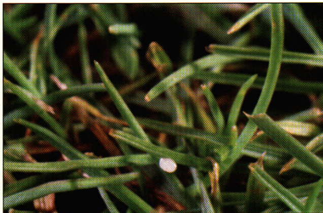
Fig. 2. Black cutworm eggs on bentgrass

Life history: Black cutworms overwinter in the southernmost regions of North America. Every year, the adult moths migrate northward and arrive in Michigan in early to mid-June. They can complete one to three generations per season in Michigan. The adult moths mate and feed at night on flowering trees, bushes or weeds near the golf course. The female lays eggs singly on the tips of grass blades (Fig. 2). One female can lay 300 to 2,000 eggs over a series of several days. The eggs hatch in three to 10 days (depending on temperature) and the young