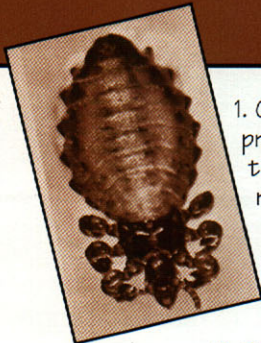
Table 2. Head Louse IPM Treatment Checklist