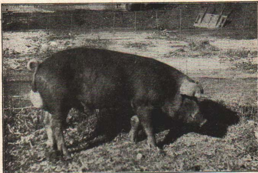
Type of boar pig that answers the present day demand.

Pigs from carefully selected, pure bred or grade sows, sired by pure bred boars of the same breed and of correct type and conformation give best results. The right type for filling your market demand should be considered