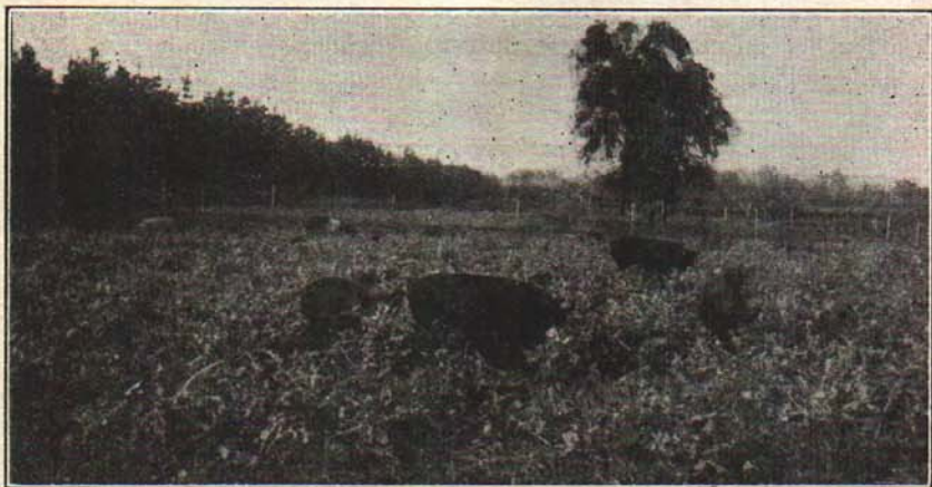
Better pastures, in combination with all rations, produce pork more economically.

Good pasture should be a part of every summer ration. Alfalfa, clover, rape, sweet-clover, blue grass, and many other crops are recommended for hog pastures. Any of these are excellent during the period that they produce an abundant supply of fresh, succulent forage. A good swine pasture will