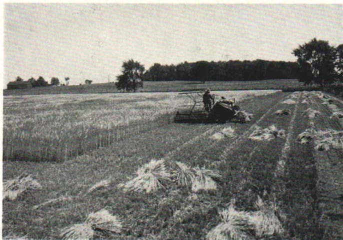
Fig. 2. Barley should be completely ripe when it is cut with the binder.