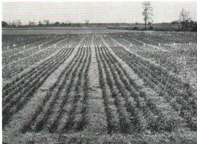
Fig. 1. Determining the best rate for seeding barley, East Lansing.

2. Spartan barley has a larger grain than Wisconsin 38 , and it should be planted in the amount of 2 to 2\frac{1}{2} bushels per acre.