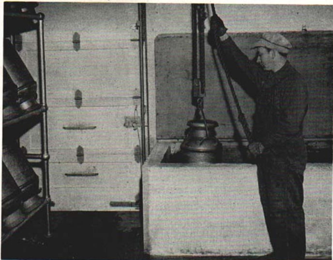
Fig. 7. The insulated concrete tank is most widely used in cooling milk. This dairyman has a device for conveying the cans of milk into and out of the tank. Note also his home-made can rack.

Tubular coolers are speedy, effective devices for cooling, but they are awkward utensils to wash and sterilize, thus constituting an ex-