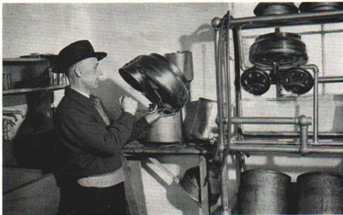
Fig. 2. But the inspection service does not restrict its attention only to the tests on milk. Here an inspector in his visit to a farm inspects the milk house and gives close attention to the utensils—their construction, state of repair and especially their cleanliness. Proper attention to utensils is a big step in quality milk production.

shall be at a temperature of 60° F. or lower when received from the producer. Various cities may have different temperature demands. The sediment test is also usually run to ascertain if the milk contains any visible foreign material.