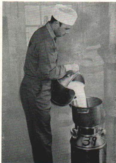
Fig. 10. Quality milk must be promptly removed from the stable. Proper straining in the milk house or straining room is the next step before cooling.