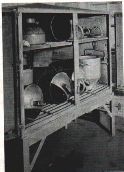
Fig. 6. Steam-cabinet with doors ajar. Utensils here are effectively treated at 170° F. for 15 minutes. The heat then dries them promptly. They are protected here till the next milking.

Chemicals are used more nowadays than formerly for treating utensils and are especially adapted where facilities for abundant hot water or steam are not available. With their use it is often advantageous to treat the utensils at the start of the next milking. As a matter of fact, many producers have found that with any method of treatment best results are obtained when it is done at the start of the next milking, the utensils having been only washed at the end of the previous milking. This is especially true if facilities for storing the utensils may not be entirely satisfactory.