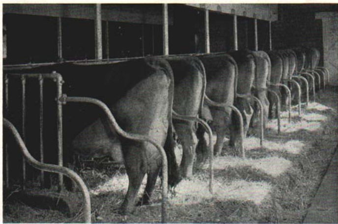
Fig. 4. Clean cows in a clean, well-bedded, well-lighted barn. Note that the cows are properly clipped for quality milk production. With the clippers, a line is run from the pin bone to the milk well on each side of the cow. All long hair below this line—except the switch—is clipped once or twice each winter.

Clipping the cows to remove the long hair on the flanks, udder, underline, tail and rear legs is another useful step in clean milk production though it may not always be feasible unless a power clipper is available. When a cow is properly clipped she does not collect filth so readily; she can also be more effectively curried or brushed. It is found that clipping in December removes the long growth of hair that comes with cold weather. By February, another clipping is desired. Then by the