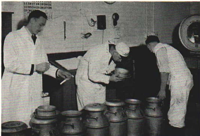
Fig. 1. A final check on milk quality is the tests made at the "platform" when milk is delivered. At left, the inspector takes the samples for his tests. The men who weigh and empty the cans also take tests and examine the milk for flavor.

The one test used universally is the determination of the fat content because milk and cream are purchased on this basis. Likewise, as producers sell milk, it is tasted regularly or at periodic intervals at the receiving platform to determine its flavor. At intervals the dairy plant and the inspection service make other tests. The temperature of each can of milk is determined. Michigan law stipulates that milk