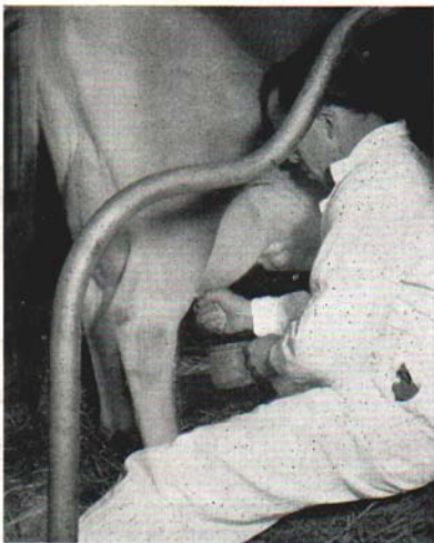
Fig. 3. A strip-cup is a material aid to quality milk production, especially when a milking machine is used. The first few streams from each teat are milked into the cup and then discarded in the gutter—not on the stall floor. Special cups with wire gauze can be purchased or use can be made of any tin cup with a cloth—preferably black—stretched over the top and held in place by a rubber band.

Another argument for use of a strip-cup is based on the fact, that the first few streams of milk from each teat are invariably contaminated with bacteria. If this fore-milk is drawn into a strip-cup, so that it may be discarded and not included with the regular milk, there is a reduction of the bacteria count of the milk that is sold. This fore-milk comprises a quite insignificant quantity and is virtually devoid of fat, so the discarding of it does not reduce the income from the cow.