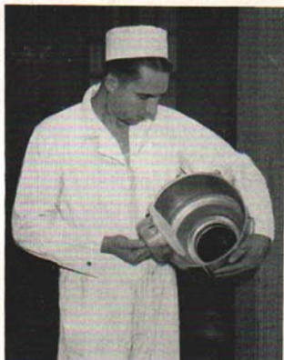
Fig. 9. An excellent kind of strainer is being assembled for use. The pad is ready to be inserted. The flow of milk from the pail does not fall directly onto the pad.

While a milk house is not always considered a necessity in producing quality milk, it is a material aid. The milk house is the logical