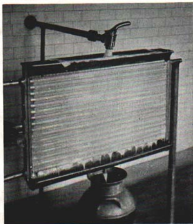
Fig. 8. A tubular cooler with the milk coming from the strainer tank in adjoining room and being rapidly cooled to 40° F.

Can coolers are devices to cool milk quickly in the can by means of an agitator that stirs the milk and of piping that discharges streams of water to flow down the outside of the can. While some of these are difficult to clean properly they do offer possibilities for effective cooling.