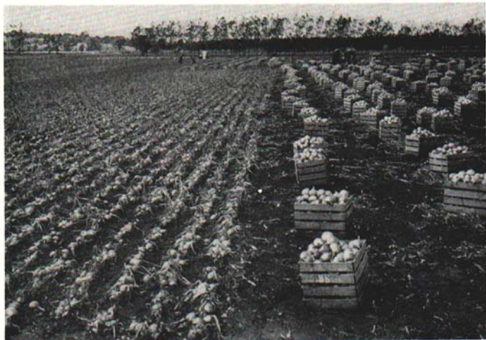
Fig. 5. Labor required for harvesting is likely to prove the "bottleneck" in the production of vegetable crops. Plan now to so plant your crops that they can be harvested and marketed with a minimum of labor.