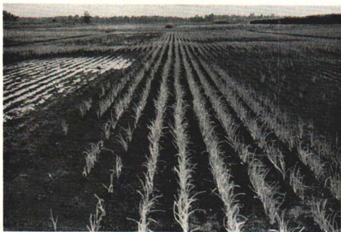
Fig. 1. The outlet drain on this muck was insufficient to take care of the excess water in a wet season, consequently a complete loss of the crop resulted. Take care of the drainage needs on your muck land now and be ready for producing good yields in any weather.

A perfectly drained muck soil is one in which the water level remains uniformly at the distance below the soil surface, which is ideal for the crop being grown, no matter how heavy the rainfall or how severe the drouth. The more independent the grower of muck crops can be from weather conditions, the greater the likelihood of a maximum crop yield.