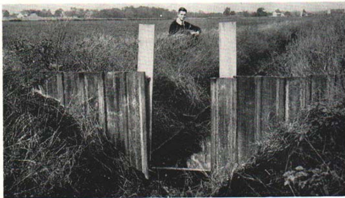
Fig. 2. The owner of this large muck farm has a number of dams located in the ditches on his farm so that he is able to hold up the water level in drouthy periods and thus obtain maximum yields.

For that reason the muck farmer, with sufficient ditches and tile lines to remove the excess water rapidly and with dams in his ditches to hold up the water to maintain the proper level in time of drouth, is much more likely to get a good yield each year than is the one who has little or no control over the water level.