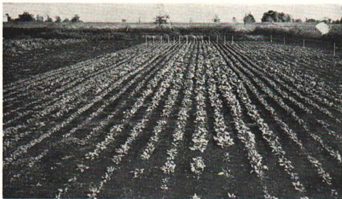
Fig. 6. Spinach variety trials on Michigan State College muck plots. Note the difference in amount of growth (2 rows per variety). Select varieties of crops that will produce good yields and satisfy governmental requirements and the demands of the consuming public.

Muck-grown spinach has an advantage over upland spinach in that it contains no grit. For that reason the muck-grown crop is preferred by the canning companies. The crop does best with a fairly good supply of moisture but, since it is a short-season crop, the spring crop will do fairly well on the better-drained soil. Spinach responds to manganese sulphate on alkaline muck and to copper sulphate on acid muck. It sometimes is benefited by copper sulphate, in addition to the manganese, on alkaline soil. The crop also responds to borax, especially on new ground. The smooth-leaved Giant Nobel variety generally is preferred by the canning companies, while the savoyed-leaved long-standing Bloomsdale is grown largely to supply local markets. The Viking, a slightly savoyed-leaved variety has found favor for both purposes. The crop should be sown in the latter half of April in the locality