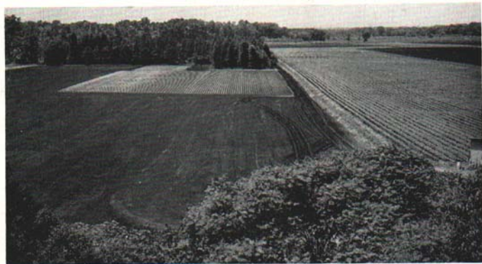
Fig. 3. This large muck area, not many years reclaimed, but now properly drained and well fertilized, is producing each year large yields of high-quality vegetables.

Productive muck soil generally contains from 2 to 3 per cent nitrogen, which is ample to supply the needs of the majority of the crops