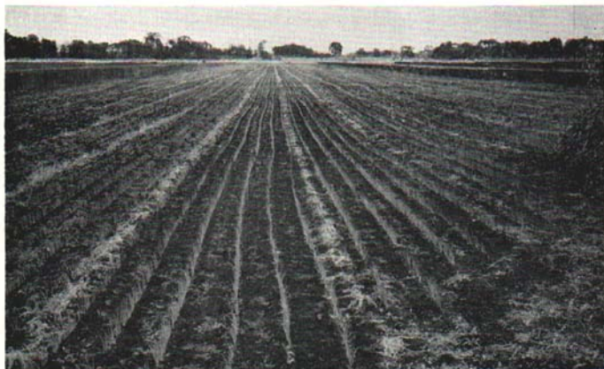
Fig. 4. This muck area is protected by occasional tree windbreaks, supplemented by highway fence set up at intervals across the field and by drills of grain between every six crop rows. The grain had been cut with a wheel hoe shortly before the picture was taken.