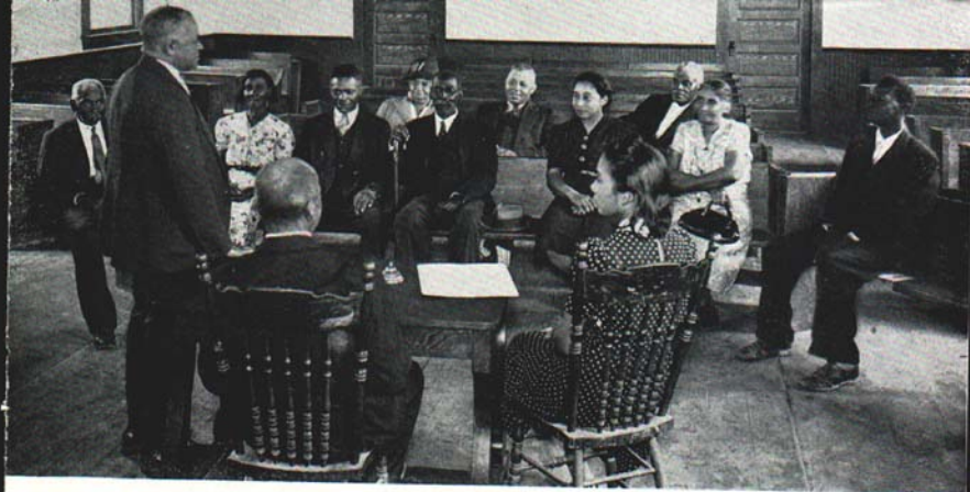
Scientific tests prove that any race is capable of making democracy work. In this picture are shown Negro men and women meeting to discuss a program of community betterment.