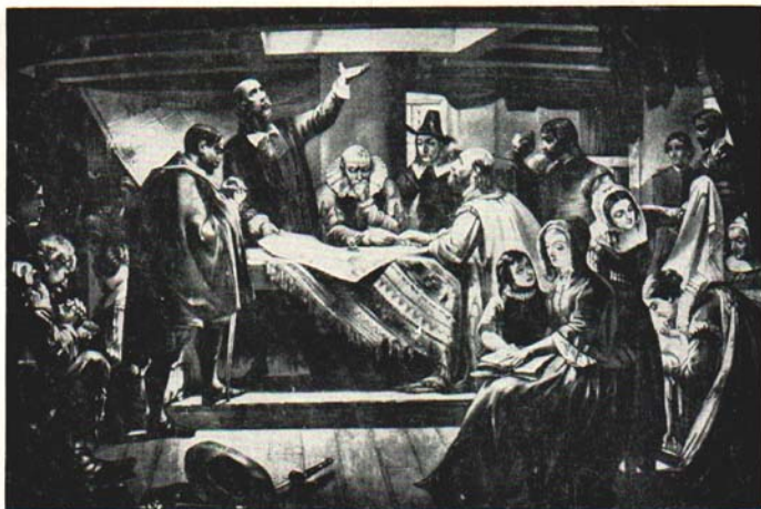
The first American colonists brought the seeds of democracy with them. This painting depicts the adoption of the Mayflower Compact in 1620.