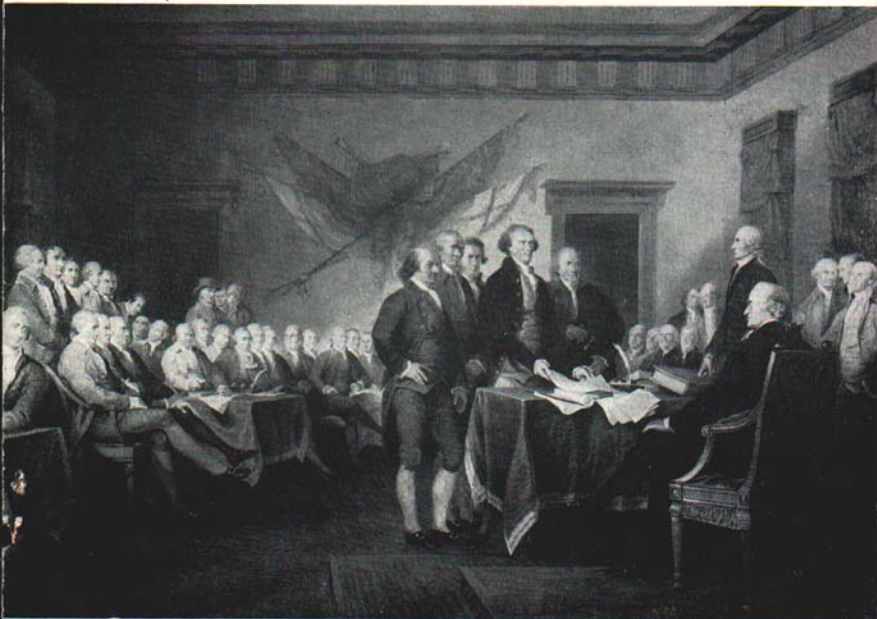
Signing of The Declaration of Independence

MICHIGAN STATE COLLEGE :: EXTENSION SERVICE