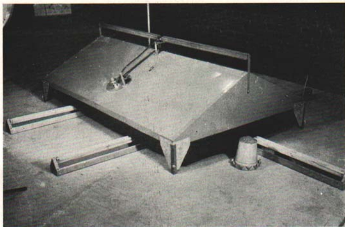
Fig. 1. For the first few days one end of the feeders are placed under the brooder.

For the first few days the feeders should be placed under the brooder, or food may be sprinkled on papers or on paper plates under the brooder. The feeders are placed toward the center of the brooder, like spokes in a wheel (as shown in Fig. 1), and when all the chicks have learned to eat, the equipment may be gradually moved out (Fig. 2).