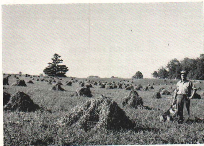
Fig. 2. Proso should be placed in long shocks to facilitate drying. The leaves and stems are still somewhat green when the seed is sufficiently mature to harvest.

Proso may be harvested with the binder and threshed with the grain separator, or it may be harvested with the combine. Less danger of mold and a higher quality of seed may be obtained by spreading the seed to dry immediately after harvest if the weather is damp at harvest time. If cut with the binder, the Proso should be placed in long shocks to facilitate drying.