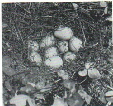
Fig. 4. No birds from hard-cooked eggs—Burning can seldom be justified as a farm practice.