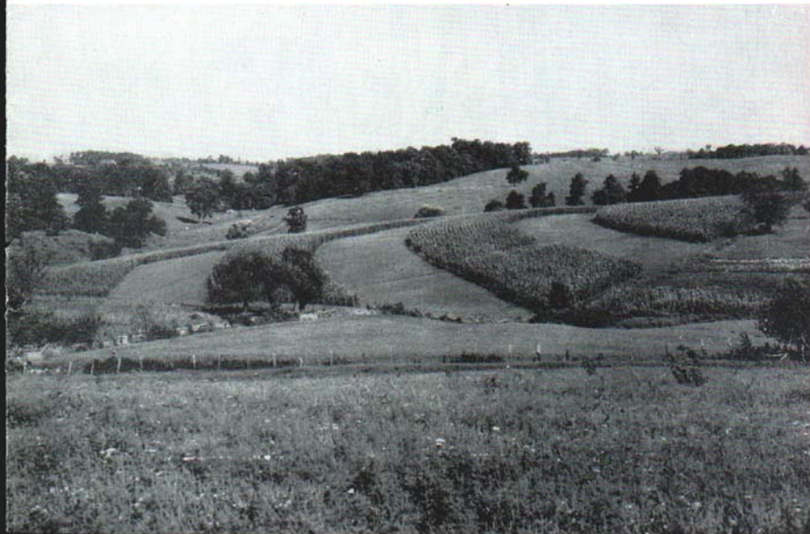
Fig. 10 (B). Erosion under control—Strip cropping halts erosion and provides excellent habitat for game animals.