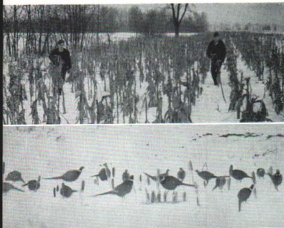
Fig. 11. Feeding stations and food patches—The bread line during the "tough season".

the binder has been run in making the first round for wildlife food. Manure spread on the fields during the winter not only is considered a good farming practice, but