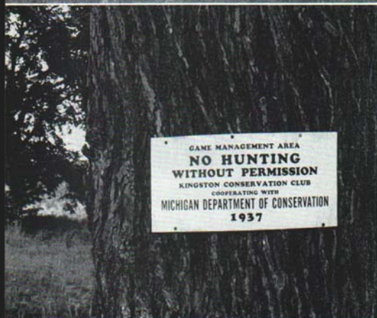
Fig. 13. Game management cooperatives (Williamston Plan) aids wildlife, assists in controlling trespass, and limits harvest to annual surplus.