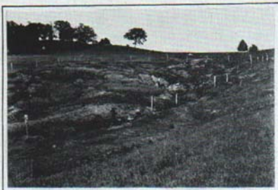
June 1935 Planted area fenced from pasture