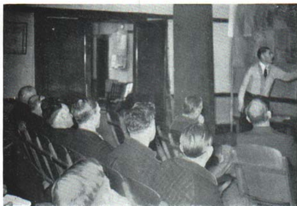
Fig. 1. In some counties land-planning committees of farmers decide what lands are best suited for wildlife habitat.