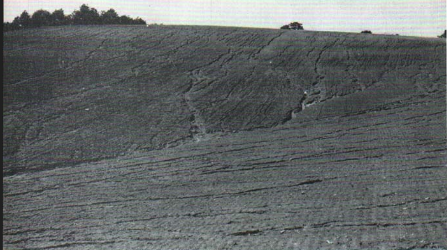
Fig. 10 (A). Land destruction casts its shadow.

trees planted in the form of an L on the north and west sides of the buildings. The location of the windbreak should be carefully selected so that the trees will protect all farm buildings, but not be so close to any of them that snow drifting through the windbreak causes inconvenience. It is not advisable to plant a windbreak on the south side of the buildings because cooling winds in summer frequently are from that direction.