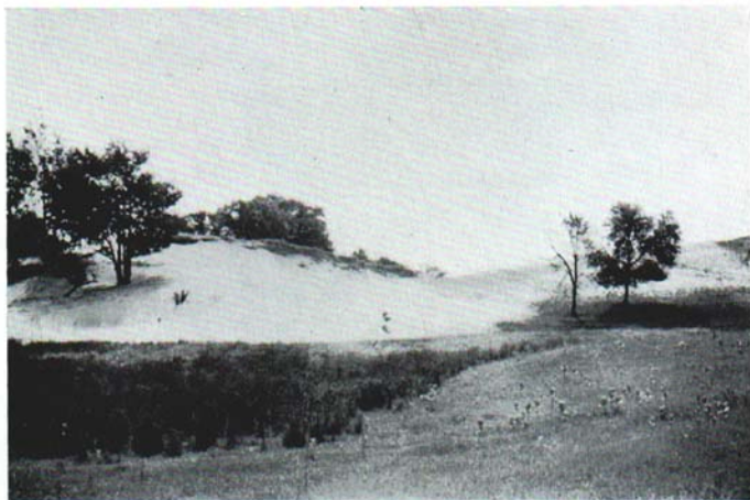
Fig. 5. "Going with the Wind".

ing and burning and allowing natural vegetation to grow is enough. The landowner may want to speed up this process by planting suitable vines, trees or shrubs. Such locations may be used to plant Christmas trees, fruit or nut trees or other plants from which he will derive some direct return. The species to be used will depend on the location of the area and the soil conditions.*