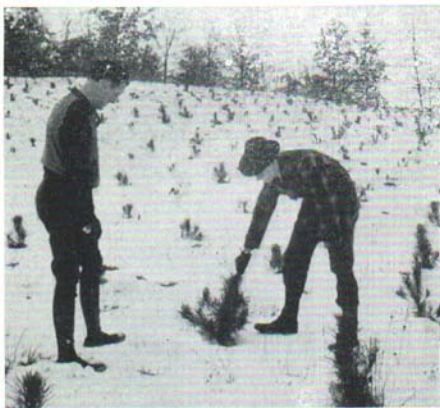
Fig. 8. Conifer plantations check erosion, provide trees and establish rabbit cover.

**Michigan State College Circ. Bul. 162, "Soil Erosion in Michigan Orchards"