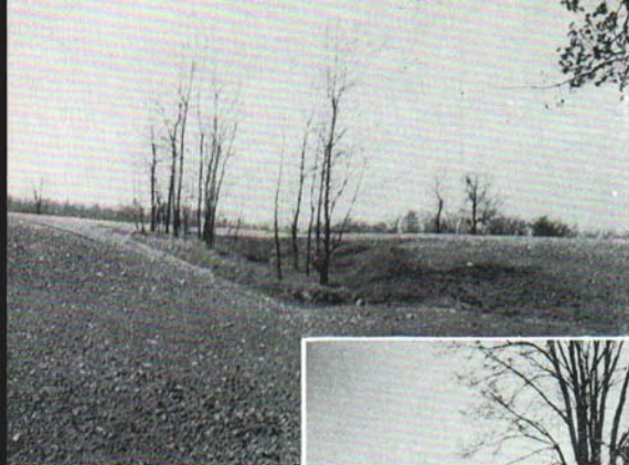
Fig. 6. Non-tillable acres put to work—Songbirds, furbearers, and game animals—welcome!