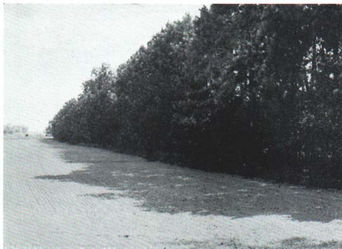
Fig. 9. Wind erosion checked by a windbreak is good soil conservation, provides farm trees and increases the possibility for additional wildlife.