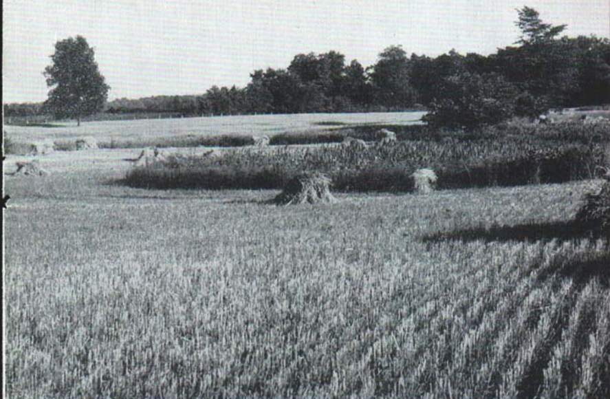
Fig. 12. "Park Avenue" for the pheasant—This combination of grain field, swale and woodlot is ideal for pheasants, quail, and the cottontail rabbit.

likewise supplements the natural winter food supply for ground-feeding birds.* The combining of small grains not only leaves a high stubble, which is good concealing cover for pheasants, ducks, Hungarian partridge and quail, but the waste grain and the additional weed growth which remains provides much needed winter food. Corn fields which are one of the most important sources of winter food especially for pheasants and in some places ducks, have very little such value if the stalks are cut close to the ground and the