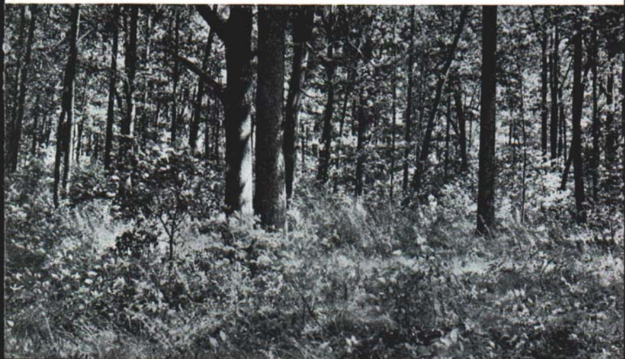
Fig. 2 (B). The woodlot with a future. Non-pasturing and selective cutting of timber will provide continuous new growth.