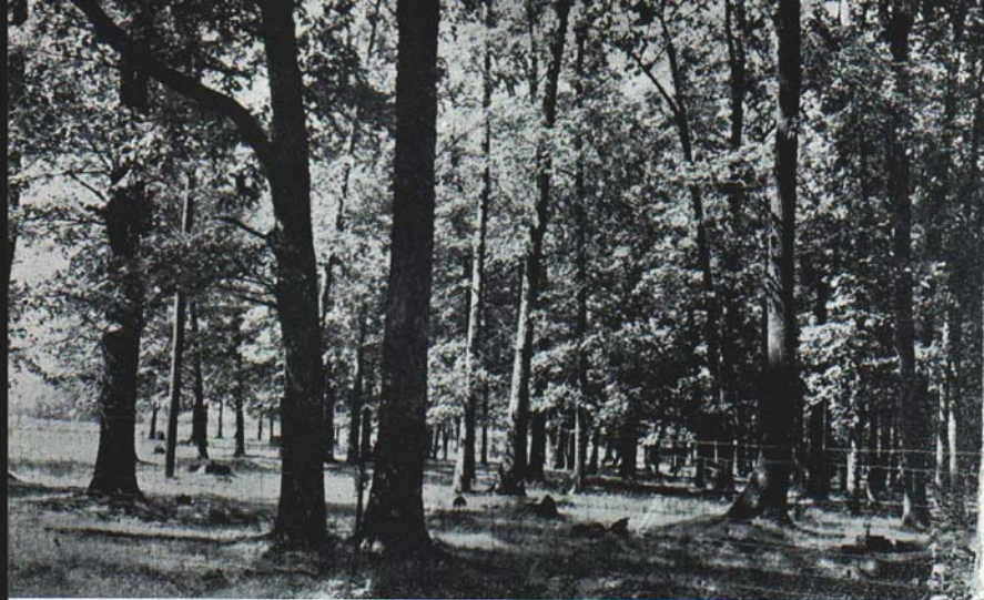
Fig. 2 (A). A wildlife desert—Pasturing a woodlot destroys mulch, young trees, wildlife cover, stimulates erosion and retards animal disease control.

ing, or the hollow logs left lying on the ground. Squirrels, raccoons, chickadees, wood ducks, screech owls, woodpeckers, and many other birds use the stubs, while rabbits and fur-bearing animals use the hollow logs.