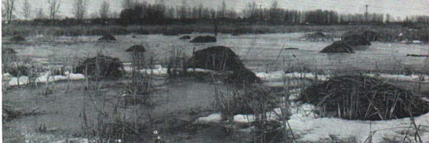
Fig. 3. There's gold in "them thar" marshes.

cover—which is desirable for wildlife coverts—be destroyed, but water erosion resulting from close grazing and hoof diggings may soon make the pond uninhabitable by animal life. Conifer and shrub plantings around the edge of such a pond may be a desirable activity for the landowner, or a natural habitat will usually occur provided such areas are protected from livestock and burning.