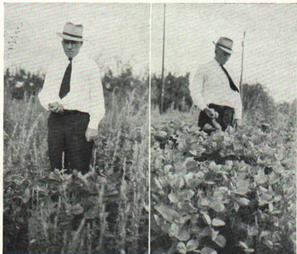
Fig. 5. Effect of a complete fertilizer on cover crop growth. In figure at right 250 pounds of 2-12-6 was applied per acre while figure at left received no fertilizer.

Applying the Fertilizer —Apparently fertilizers can be applied to best advantage about ten days to two weeks previous to blooming. They should be broadcast around the trees and extending a little beyond the outer spread of the branches and kept about two feet from the trunks. The amounts necessary to apply will vary with the age and size of the tree. Sulphate of ammonia may be applied at the rate of not more than one-fourth pound for each year of the tree's age; the