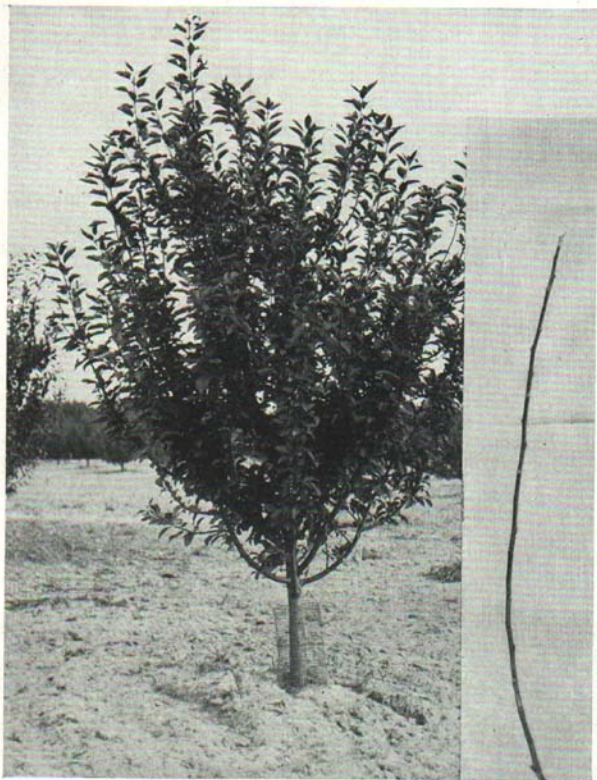
Fig. 2. Four-year-old Red Delicious that has made a desired amount of growth. Insert shows terminal growth of 18 inches.

Tree Growth —Young non-bearing trees that fail to make the desired amount of growth when soil moisture conditions are favorable will usually respond to applications of a nitrogenous fertilizer. On the other hand, the rather common practice of forcing young trees to grow more than a reasonable amount should be avoided. A tree making a normal amount of growth will bear earlier than trees making twice that amount of growth and will be less susceptible to winter injury. From this standpoint it would be better to have a tree grow too little rather than too much. Under normal growing conditions the