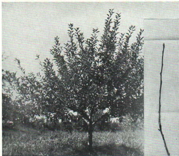
Fig. 3. Twelve-year-old Elberta still in sound condition and making plenty of terminal growth to keep it in a productive state. Insert shows terminal growth for 1939.

Cultural Practices —In the young orchard it is good practice to cultivate frequently, at least a strip along the tree rows, until the cover crop is sown during the first part of July. If with this tillage treatment the needed amount of growth is being made each year, it is questionable if there is any need of applying fertilizer. If such growth is not being made then not more than one-fourth pound of sulphate of ammonia (or its nitrogen equivalent) for each year of the tree's age may be applied. A vigorous cover crop of soybeans, sudan grass, or similar long-season plant, if sown early enough to become well established before the summer drouth, for instance, in late June or perhaps in early July, will usually check the growth of young trees. A vigorous cover crop will also reduce wind and water erosion and, when worked into the soil, will supply organic matter needed in most orchard soils.