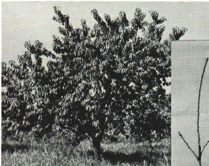
Fig. 4. Golden Delicious 14 years old that produced a heavy crop in 1939 and made a sufficient terminal growth of 12 inches as shown by the insert.