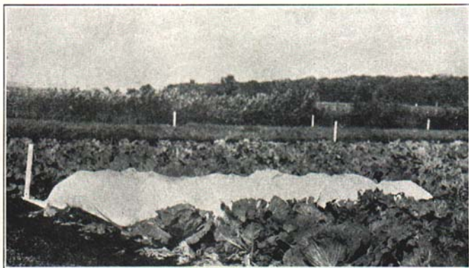
Fig. 1. Cabbage dusted for aphid control and covered with light cloth to confine fumes.