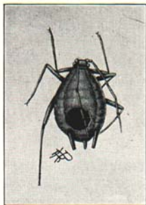
Fig. 7. An aphid from which Lysiphlebus has emerged (greatly enlarged).