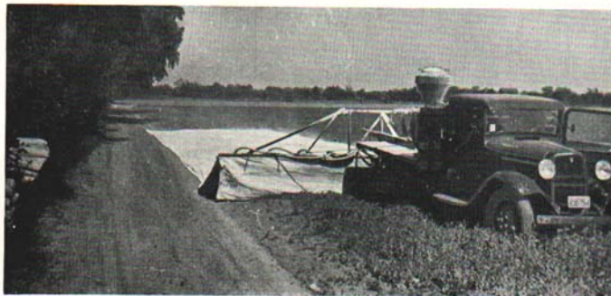
Fig. 4. Duster equipped with trailer in pea field.

dry with rains of the heavy, dashing kind; then, parasitic diseases and insects start work almost as soon as the plant lice, and the plant lice never have a chance to become plentiful.