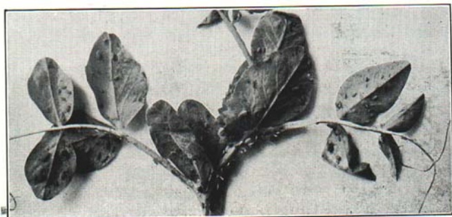
Fig. 3. Pea vines showing the effect of pea-aphid.