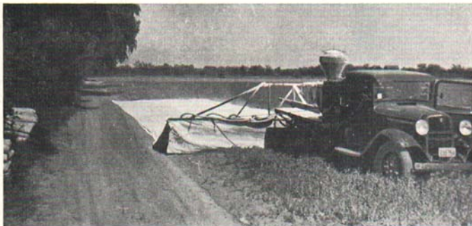
Fig. 4. Duster equipped with trailer in pea field.

Like many other aphids, it feeds on a variety of plants, preferring alfalfa or red clover for winter quarters and migrating to a variety of legumes or other plants for the summer. Each female is capable of giving birth to a large number of young, the record number being 147. The average number of young born to each female is, however, less than 70, and the number of annual generations in Michigan about 10 or 12.