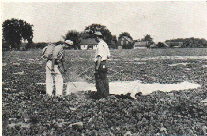
Fig. 2. Dusting cucumbers for aphids with hand duster and light cloth trailer.

Aphids on cucumbers or melons may be controlled by spraying with nicotine 1 pint in 100 gallons of water plus 5 pounds of thoroughly dissolved laundry soap or other spreader. The only machine suitable for a spray application is a power sprayer. Plenty of pressure directed toward the plants from any direction except straight down will insure hitting the undersides of the leaves. A hand sprayer is useless.