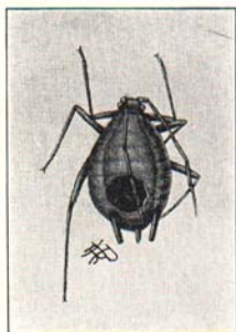
Fig. 7. An aphid from which Lysiphlebus has emerged (greatly enlarged).