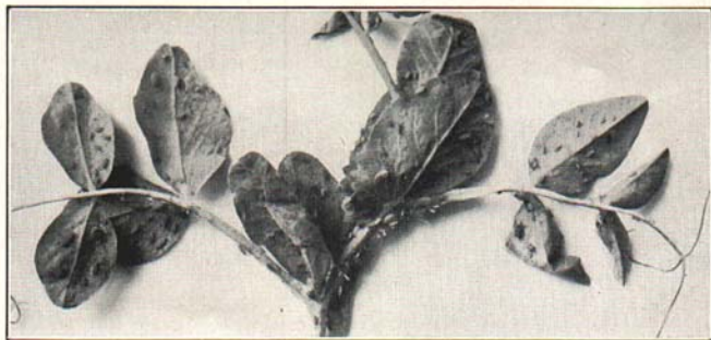
Fig. 3. Pea vines showing the effect of pea-aphid.

The pea aphid is an insect that is the cause of severe losses to the pea canning industry and to growers of garden peas.