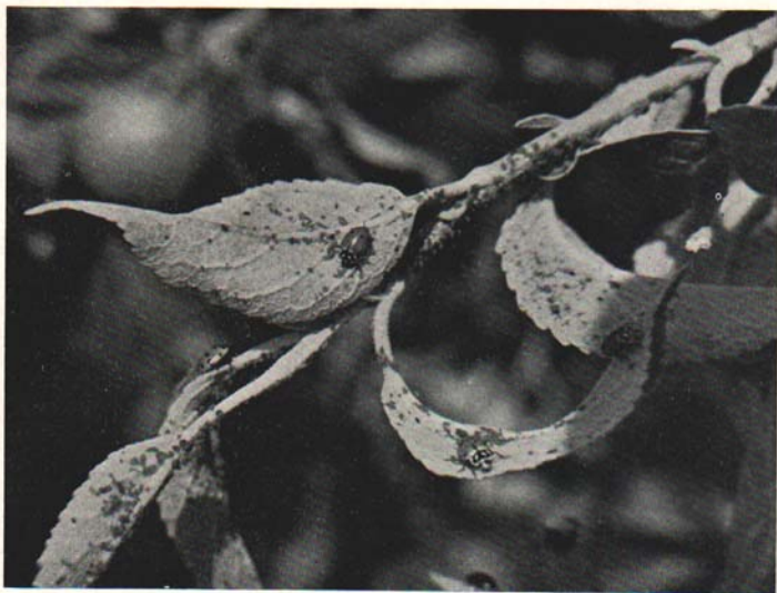
Fig. 5. Ladybird beetles feeding upon aphids.

It is with this thought in mind that a few illustrations of beneficial insects and their work are inserted.