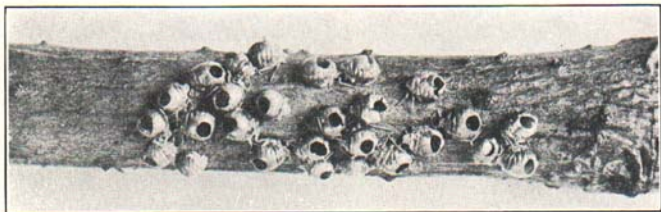
Fig. 6. Parasitized aphids showing holes through which Lysiphlebus parasites have emerged. Enlarged about three times.