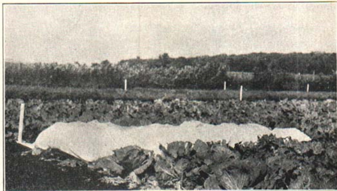
Fig. 1. Cabbage dusted for aphid control and covered with light cloth to confine fumes.

has been dissolved, is effective if applied under pressure by means of a power sprayer. (Sulphated alcohol spreaders, according to manufacturer's directions; summer oil emulsion, one-half gallon; or liquid soap, one-half gallon, may be used in place of laundry soap.) Freshly prepared, hot, 4 per cent nicotine dust, applied through a large tin, funnel-shaped chamber, which is set down over the plant for a brief interval and which confines the fumes, has been successfully used by market gardeners in Michigan on cauliflower and cabbage. Covering plants with a light cloth trailer for a few minutes immediately after dusting with an ordinary hand crank duster confines the nicotine fumes and is a great aid in control.