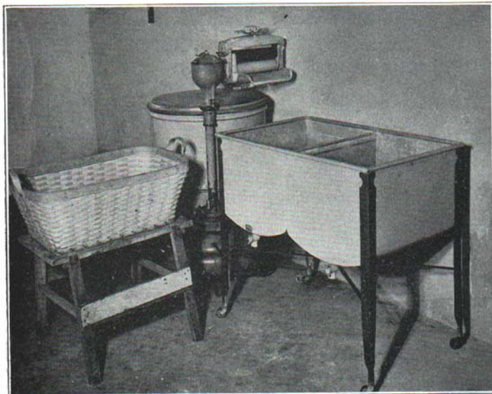
Fig. 1. Equipment for washing including machine, wringer, two portable tubs, basket and stand. Note the drains on the tubs and the wall outlet for attaching the machine. Running water would add to the efficiency of this arrangement.

The electrically driven washing machine is the simplest to operate of all types. Most of them are equipped with one-quarter horse power motors which will operate on three kilowatt hours of electricity to do 10 hours of washing. This is approximately one month's operation.