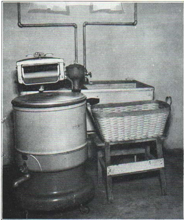
Fig. 2. Convenient arrangement of washing equipment including machine, two stationary tubs, basket and stand. The tubs are equipped with hot and cold water and drains.

Two other types of machines found on the market are the vacuum-cup and cylinder. The vacuum-cup machine has one or more inverted cups attached at the top of a centrally located vertical shaft. These cups usually move up and down and in a horizontal position thus forcing the water through the clothes.