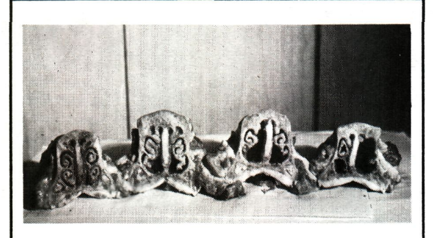
Figure 2. Atrophic rhinitis. The cross section of the nose on the left is normal. The three on the right show various degrees of atrophic rhinitis. Note the condition of the cartilage separating the two sides of each nose, and the amount of destruction of the turbinates.

roundworm or kidneyworm problem in the herd, and of the effectiveness of the deworming program. In some confinement operations slaughter check monitoring may be a better alternative than routine deworming.