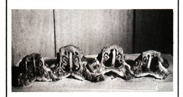
Figure 2. Atrophic rhinitis. The cross section of the nose on the left is normal. The three on the right show various degrees of atrophic rhinitis. Note the condition of the cartilage separating the two sides of each nose, and the amount of destruction of the turbinates.

roundworm or kidneyworm problem in the herd, and of the effectiveness of the deworming program. In some confinement operations slaughter check monitoring may be a better alternative than routine deworming.