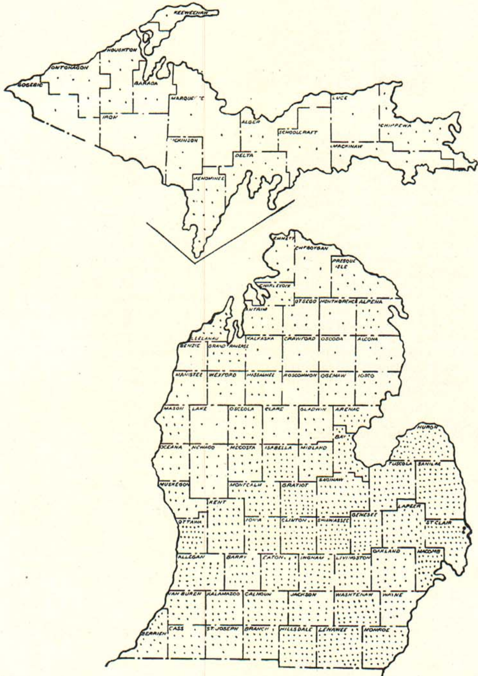
Fig. 1. Map showing Michigan oat acreage in 1934 (census figures). Each dot represents 1,000 acres.