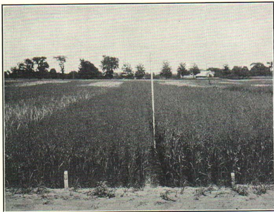
Fig. 4. Markton (left) and Wolverine (right) growing on light soils. The Markton variety will stand up on this type of soil and will give about the same yield as Wolverine.