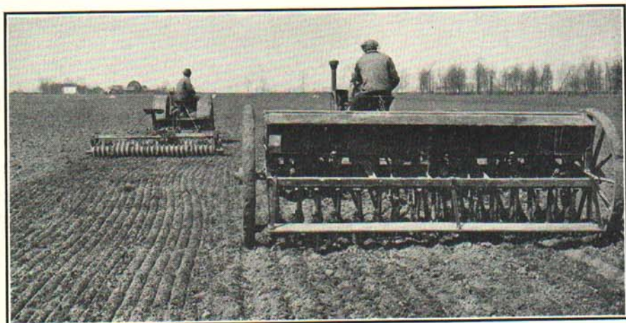
Fig. 5. Land which has grown clean-cultivated crops such as corn, beans, or sugar beets may quickly be brought into excellent condition for oats.

The fact that oats appear bright is not a definite guarantee that they have a high germination. Oats may have a reduced germination because of poor shock, stack, barn, or bin storage conditions. The percentage of germination is so easily determined that a sample should