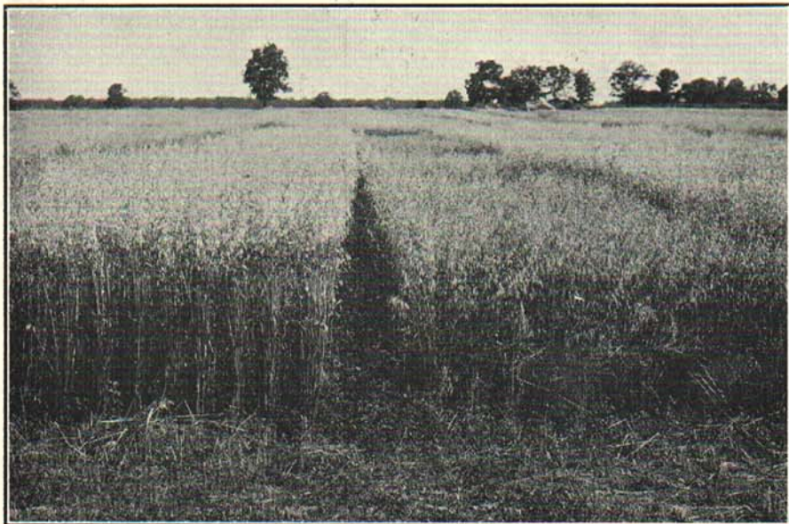
Fig. 3. This picture contrasts the difference in height of Wolverine (left) and Iogold (right), growing on medium heavy soil. Iogold is over-ripe as indicated by crinkling straw.

In those sections of the state where stem rust is prevalent, the Iogold or Iowa 444, two early varieties, will give satisfactory yields on upland soils. The value of those oats in the Lower Peninsula is