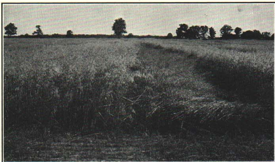
Fig. 2. Markton and Wolverine growing on medium heavy soils. Markton (right) is lodged. Wolverine (left) standing upright. In Michigan, Markton can be used on lighter soils.

A list of mid-season varieties that yield well on upland soils in the Lower Peninsula includes Wolverine, Worthy, Victory, Crown, Golden Rain, and possibly the new Star. The Wolverine is the most extensively grown. It is adapted to a wide range of soils, doing best on the medium-heavy soils where lodging is not a factor. The Worthy has the same grain type as Wolverine, but heads and ripens from one to three days later. It is shorter and stiffer of straw and is adapted to those heavy soils where lodging is troublesome. The remaining varieties mentioned possess no advantages over Wolverine. They are as late as Worthy and have the stiffness of straw of Wolverine.