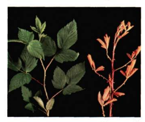
Figure 7. Small yellow infected leaves with orange spore pustules are typical symptoms of Orange Rust.

Orange rust (Kunkelia nitens) attacks black and purple raspberries, but not red varieties. Leaf symptoms develop toward the end of June. Infected leaves are small and yellowish with orange pustules of waxy rust spores on the underside of the leaves (Fig. 7). The spores are shed and cause new infections over a 2 to 3 week period. Leaf symptoms disappear from the field by mid- to latesummer. The fungus invades all parts of the plant (including the roots). Infected plants never recover. Newly infected