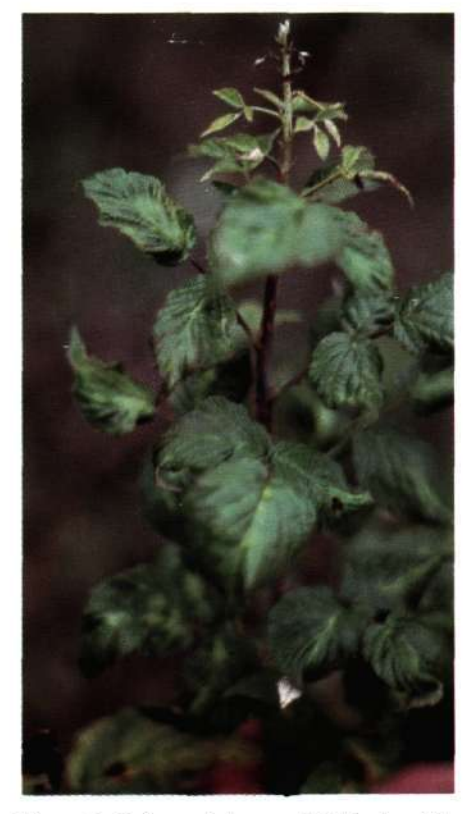
Figure 3. Deformed leaves blotched with yellow are symptoms of Tobacco Streak Virus infection.

COOPERATIVE EXTENSION SERVICE • MICHIGAN STATE UNIVERSITY