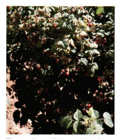
Figure 4. Tomato Ringspot Virus infection causes plant stunting and general yellowing of leaves.

range, including many weeds such as dandelion, curly dock, plantain and chickweed. The virus is spread by the dagger nematode Xiphinema ameri canum from the roots of diseased raspberry bushes or weeds to the roots of healthy bushes.