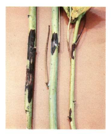
Figure 6a. Brownish purple cane lesions of Spur Blight start at a spur but can extend up or down the cane.

Spur blight (Didymella applanata), is a serious disease of red raspberry varieties. Infected canes release ascospores and conidia in May and June during rainy periods. Conidia release continues throughout the growing season during wet weather. Small, brown or purple spots appear around the nodes on the lower portions of the canes. These areas turn brown, causing the leaf and flower buds to shrivel and die. Leaf lesions appear as brown wedge-shaped areas. Diseased canes dry out and crack as they mature; the lesions turn brownish purple and enlarge to cover much of the cane (Fig. 6A).