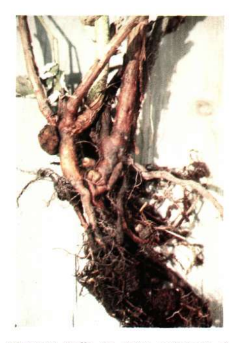
Figure 12. Galls on crown and roots of Crown Gall infected plant.

Control: Check Planting stock for suspicious swellings or galls on roots and