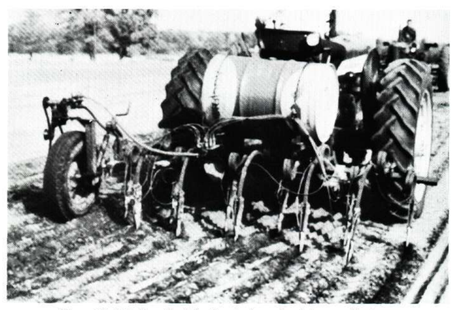
Figure 10. Injection of soil fumigant using a shank-type applicator.