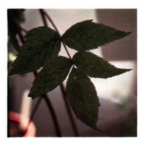
Figure 1a. Mottling of leaves is a typical symptom of Raspberry Mosaic Virus infection.

This virus is widespread throughout the Michigan fruit growing area. It causes disease in stone fruits (peaches, cherries, etc.), pome fruits (apples, pears, etc.), and grapes. Symptoms in raspberries are not very strong. A few leaves on infected bushes may show some pale ringspots in the spring, but these later disappear. The main effect is