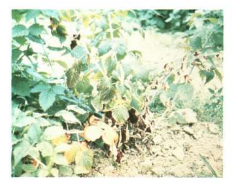
Figure 9. Leaf yellowing and blue stems are the symptoms of Verticillium Wilt.

Control: Use disease-free plants. Avoid planting raspberries for at least three years in soil that has grown tomatoes, potatoes, peppers or eggplants. Remove and burn diseased plants. Use a preplant soil fumigant if the Verticil-