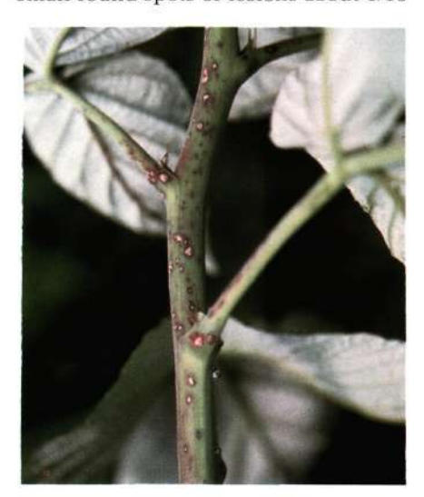
Figure 5a. Gray spots with purple borders will occur on canes infected with Anthracnose.

varieties also. Symptoms appear on canes, leaves, and sometimes on the fruit. Infected canes show tiny purple spots which progress to light grey round spots about 1/8 inch in diameter. The spots enlarge to about 1/4 inch, have ash-grey centers and may have purple borders (Fig. 5A). As the canes age, the spots appear sunken and the borders raised. Leaves will develop similar small round spots or lesions about 1/16