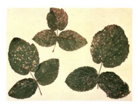
Figure 5b. Shot-hole appearance of leaves infected with Anthracnose.

inch in diameter (Fig. 5B). Diseased tissue frequently drops out leaving a "shot-hole" appearance. If the disease is not controlled, canes become cracked and the drupelets of the berries become infected, resulting in worthless fruit. The fungus survives the winter in infected canes and produces spores (both conidia and ascospores) in the spring at the time of leafing out. The disease can become serious with abundant rain in late spring and early summer, or under sprinkler irrigation.