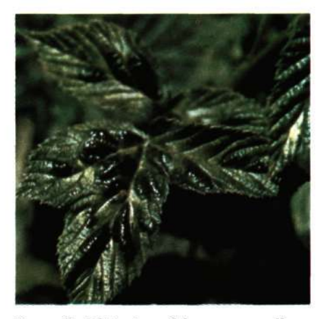
Figure 1b. Blistering of leaves as well as mosaic pattern can occur with Raspberry Mosaic Virus.

a general stunting of the bush, a general yellowing of leaves (Fig. 4) and production of small, crumbly fruit. Virtually all raspberry varieties are susceptible. Tomato ringspot virus has a very wide host