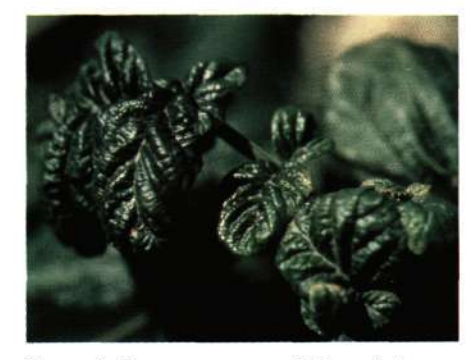
Figure 2. Leaves are rounded, curl downward and dark green in color with Raspberry Leaf Curl Virus infection.

a general stunting of the bush, a general yellowing of leaves (Fig. 4) and production of small, crumbly fruit. Virtually all raspberry varieties are susceptible. Tomato ringspot virus has a very wide host