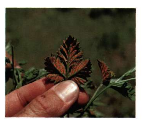
Figure 8. Orange rust pustules on back of Late Leaf Rust infected leaf.

Late leaf rust ( Pucciniastrum ameri canum ) causes disease in red raspberries, usually later in the season. Older (basal) leaves are covered with fine,