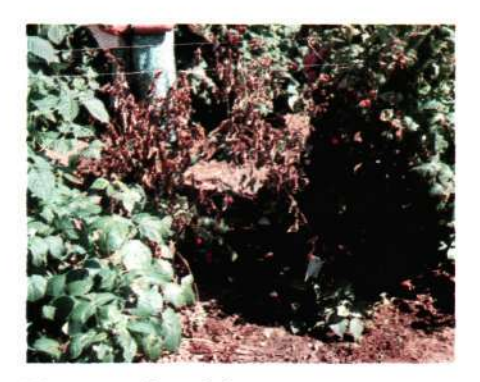
Figure 11. Phytophthora Root Rot can cause entire canes to wilt and die in mid-summer.

The bacteria of crown and cane gall (Agrobacterium spp.) cause galls on roots (Fig. 12) or on canes. Infected bushes become weakened, stunted or unproductive as a result of the gall tissue interfering with water and nutrient