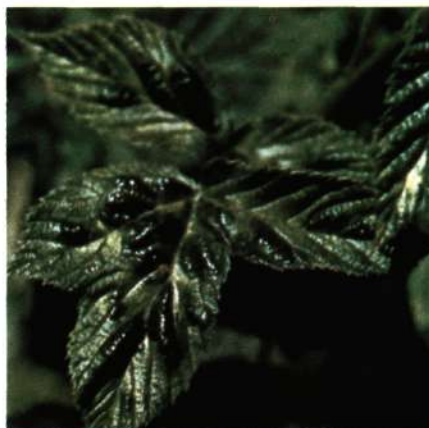
Figure 1b. Blistering of leaves as well as mosaic pattern can occur with Raspberry Mosaic Virus.

This virus is widespread throughout the Michigan fruit growing area. It causes disease in stone fruits (peaches, cherries, etc.), pome fruits (apples, pears, etc.), and grapes. Symptoms in raspberries are not very strong. A few leaves on infected bushes may show some pale ringspots in the spring, but these later disappear. The main effect is