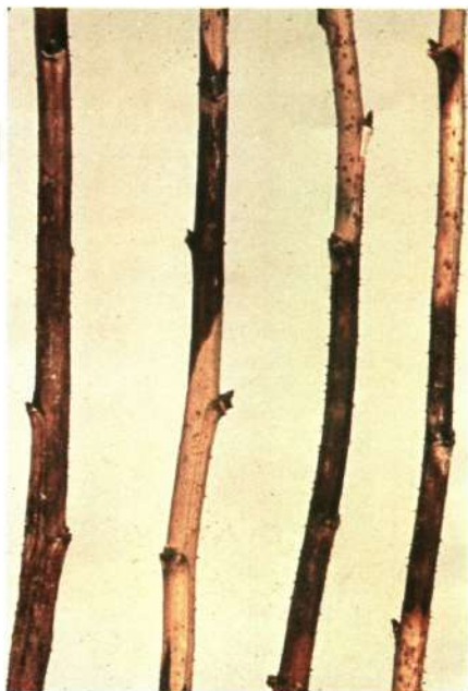
Figure 6b. The long brown or black cane lesions of Cane Blight can be easily confused with those of spur blight.

weather. To prevent infection, canes should remain dry for at least 3 days after pruning so wounds will callus. Prune out and burn infected canes in the spring.