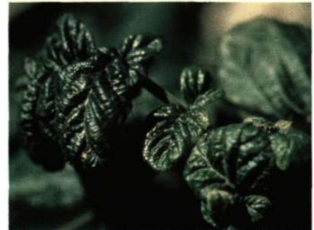
Figure 2. Leaves are rounded, curl downward and dark green in color with Raspberry Leaf Curl Virus infection.

a general stunting of the bush, a general yellowing of leaves (Fig. 4) and production of small, crumbly fruit. Virtually all raspberry varieties are susceptible. Tomato ringspot virus has a very wide host