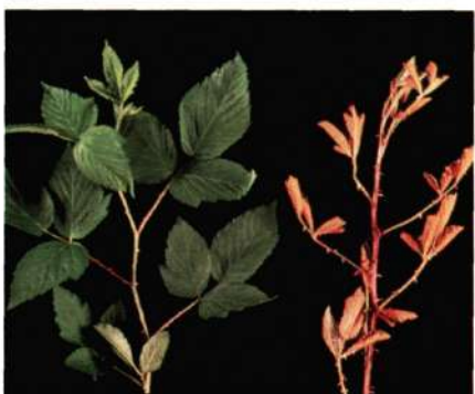
Figure 7. Small yellow infected leaves with orange spore pustules are typical symptoms of Orange Rust.

Orange rust ( Kunkelia nitens ) attacks black and purple raspberries, but not red varieties. Leaf symptoms develop toward the end of June. Infected leaves are small and yellowish with orange pustules of waxy rust spores on the underside of the leaves (Fig. 7). The spores are shed and cause new infections over a 2 to 3 week period. Leaf symptoms disappear from the field by mid- to late-summer. The fungus invades all parts of the plant (including the roots). Infected plants never recover. Newly infected