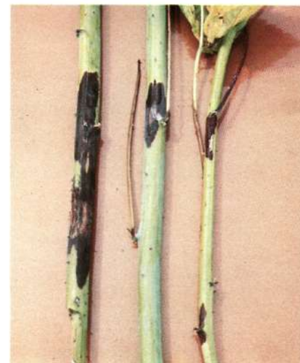
Figure 6a. Brownish purple cane lesions of Spur Blight start at a spur but can extend up or down the cane.

Spur blight ( Didymella applanata ), is a serious disease of red raspberry varieties. Infected canes release ascospores and conidia in May and June during rainy periods. Conidia release continues throughout the growing season during wet weather. Small, brown or purple spots appear around the nodes on the lower portions of the canes. These areas turn brown, causing the leaf and flower buds to shrivel and die. Leaf lesions appear as brown wedge-shaped areas. Diseased canes dry out and crack as they mature; the lesions turn brownish purple and enlarge to cover much of the cane (Fig. 6A).