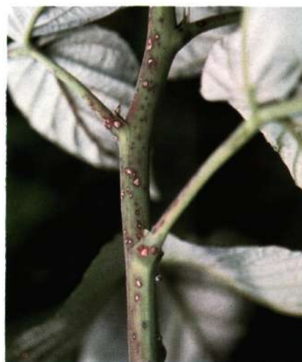
Figure 5a. Gray spots with purple borders will occur on canes infected with Anthracnose.

varieties also. Symptoms appear on canes, leaves, and sometimes on the fruit. Infected canes show tiny purple spots which progress to light grey round spots about 1/8 inch in diameter. The spots enlarge to about 1/4 inch, have ash-grey centers and may have purple borders (Fig. 5A). As the canes age, the spots appear sunken and the borders raised. Leaves will develop similar small round spots or lesions about 1/16