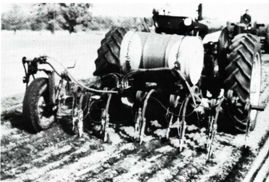
Figure 10. Injection of soil fumigant using a shank-type applicator.