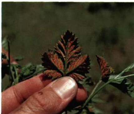
Figure 8. Orange rust pustules on back of Late Leaf Rust infected leaf.

Late leaf rust ( Pucciniastrum americanum ) causes disease in red raspberries, usually later in the season. Older (basal) leaves are covered with fine,