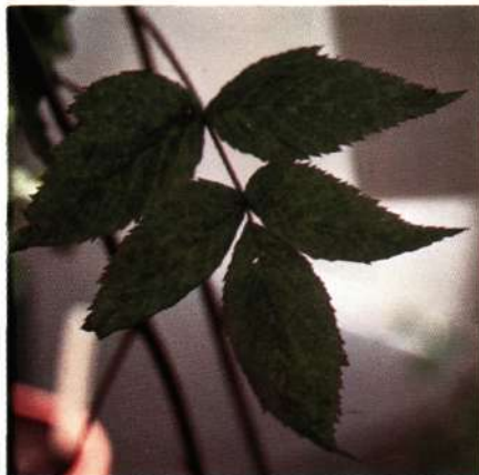
Figure 1a. Mottling of leaves is a typical symptom of Raspberry Mosaic Virus infection.

This is the most widespread and damaging raspberry virus. All commonly grown cultivars can be infected by the mosaic virus, except for Canby, which is resistant. High quality, mosaic-resistant, Canadian, red cultivars — Skeena, Nootka, Haida and Chilcotin — should be available in 1984. Mosaic symptoms consist of light green to dark green or yellow to green mottling of the leaves on infected canes (Fig. 1A); blistering of leaves as well as a mosaic pattern are also evident (Fig. 1B). The plants show a progressive stunting of growth and poor yield. Fruits on infected bushes are small and crumbly. The common raspberry aphid (a rather