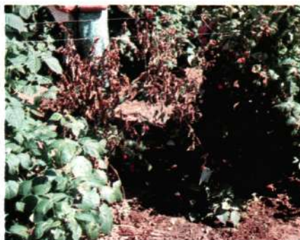
Figure 11. Phytophthora Root Rot can cause entire canes to wilt and die in mid-summer.

The bacteria of crown and cane gall ( Agrobacterium spp.) cause galls on roots (Fig. 12) or on canes. Infected bushes become weakened, stunted or unproductive as a result of the gall tissue interfering with water and nutrient