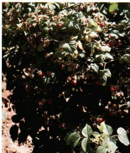
Figure 4. Tomato Ringspot Virus infection causes plant stunting and general yellowing of leaves.

range, including many weeds such as dandelion, curly dock, plantain and chickweed. The virus is spread by the dagger nematode Xiphinema americanum from the roots of diseased raspberry bushes or weeds to the roots of healthy bushes.