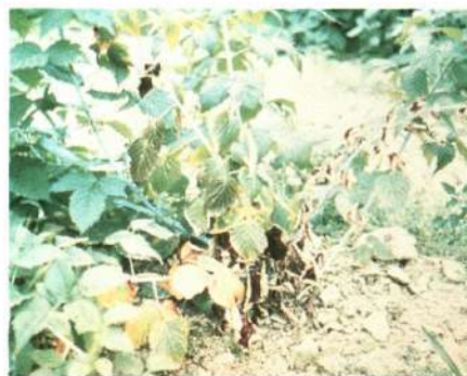
Figure 9. Leaf yellowing and blue stems are the symptoms of Verticillium Wilt.

Control: Use disease-free plants. Avoid planting raspberries for at least three years in soil that has grown tomatoes, potatoes, peppers or eggplants. Remove and burn diseased plants. Use a preplant soil fumigant if the Verticil-