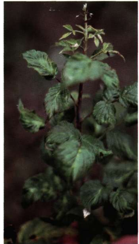
Figure 3. Deformed leaves blotched with yellow are symptoms of Tobacco Streak Virus infection.