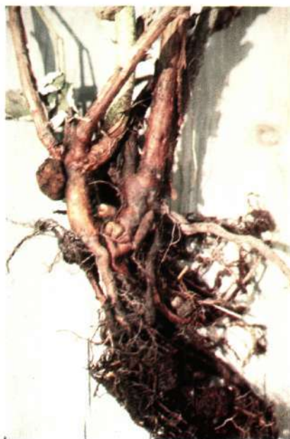
Figure 12. Galls on crown and roots of Crown Gall infected plant.

Control: Check Planting stock for suspicious swellings or galls on roots and