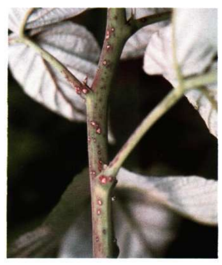
Figure 5a. Gray spots with purple borders will occur on canes infected with Anthracnose.

varieties also. Symptoms appear on canes, leaves, and sometimes on the fruit. Infected canes show tiny purple spots which progress to light grey round spots about 1/8 inch in diameter. The spots enlarge to about 1/4 inch, have ash-grey centers and may have purple borders (Fig. 5A). As the canes age, the spots appear sunken and the borders raised. Leaves will develop similar small round spots or lesions about 1/16