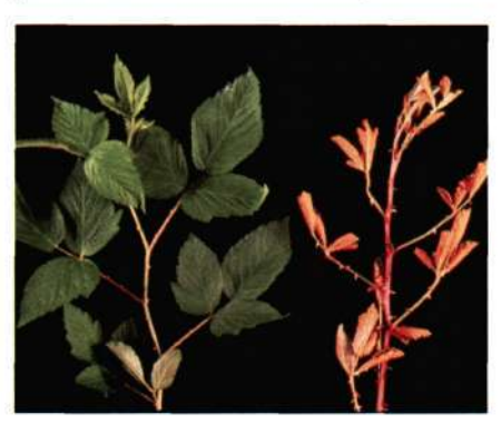
Figure 7. Small yellow infected leaves with orange spore pustules are typical symptoms of Orange Rust.

Orange rust (Kunkelia nitens) attacks black and purple raspberries, but not red varieties. Leaf symptoms develop toward the end of June. Infected leaves are small and yellowish with orange pustules of waxy rust spores on the underside of the leaves (Fig. 7). The spores are shed and cause new infections over a 2 to 3 week period. Leaf symptoms disappear from the field by mid- to late-summer. The fungus invades all parts of the plant (including the roots). Infected plants never recover. Newly infected