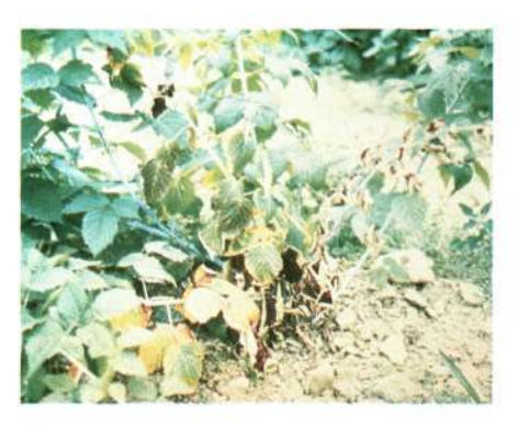
Figure 9. Leaf yellowing and blue stems are the symptoms of Verticillium Wilt.

Control: Use disease-free plants. Avoid planting raspberries for at least three years in soil that has grown tomatoes, potatoes, peppers or eggplants. Remove and burn diseased plants. Use a preplant soil fumigant if the Verticil-