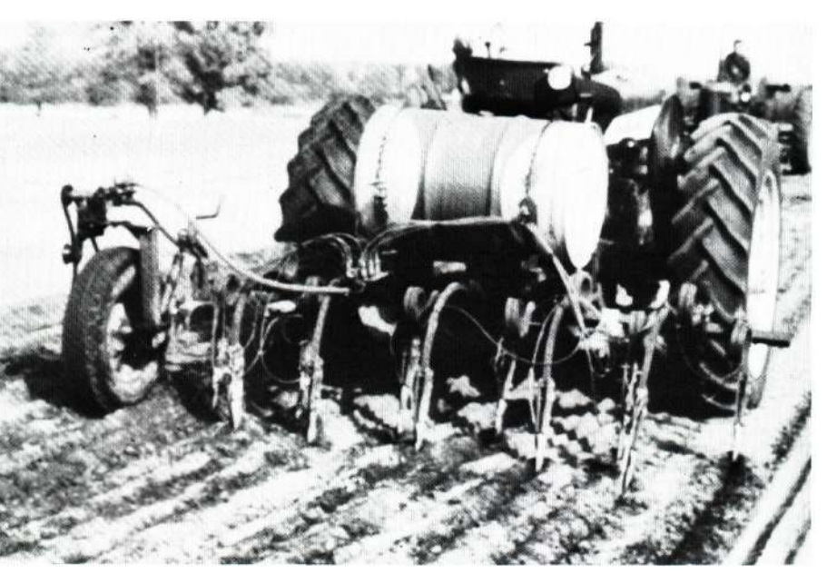
Figure 10. Injection of soil fumigant using a shank-type applicator.