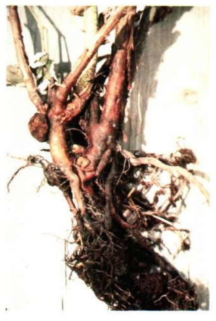
Figure 12. Galls on crown and roots of Crown Gall infected plant.

Control: Check Planting stock for suspicious swellings or galls on roots and