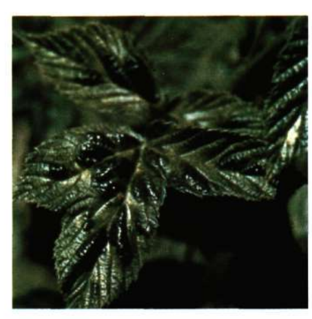
Figure 1b. Blistering of leaves as well as mosaic pattern can occur with Raspberry Mosaic Virus.

This virus is widespread throughout the Michigan fruit growing area. It causes disease in stone fruits (peaches, cherries, etc.), pome fruits (apples, pears, etc.), and grapes. Symptoms in raspberries are not very strong. A few leaves on infected bushes may show some pale ringspots in the spring, but these later disappear. The main effect is