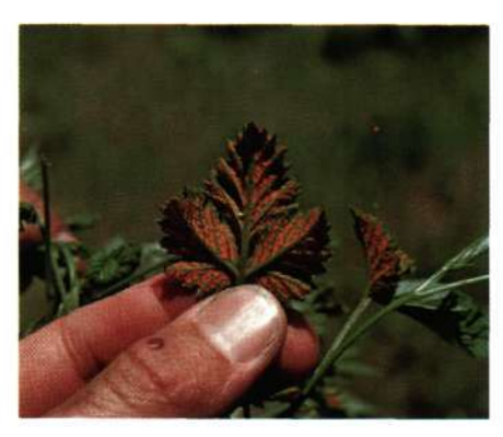
Figure 8. Orange rust pustules on back of Late Leaf Rust infected leaf.

Late leaf rust (Pucciniastrum americanum) causes disease in red raspberries, usually later in the season. Older (basal) leaves are covered with fine,