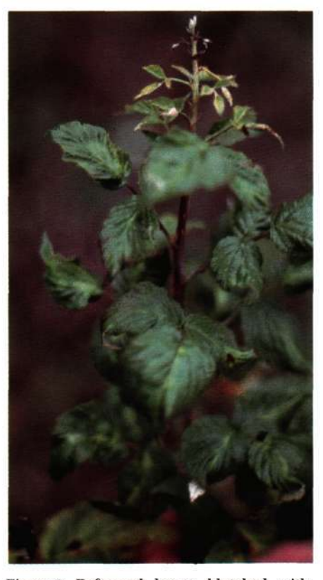
Figure 3. Deformed leaves blotched with vellow are symptoms of Tobacco Streak Virus infection.