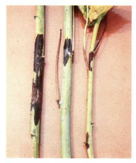
Figure 6a. Brownish purple cane lesions of Spur Blight start at a spur but can extend up or down the cane.

Spur blight (Didymella applanata), is a serious disease of red raspberry varieties. Infected canes release ascospores and conidia in May and June during rainy periods. Conidia release continues throughout the growing season during wet weather. Small, brown or purple spots appear around the nodes on the lower portions of the canes. These areas turn brown, causing the leaf and flower buds to shrivel and die. Leaf lesions appear as brown wedge-shaped areas. Diseased canes dry out and crack as they mature; the lesions turn brownish purple and enlarge to cover much of the cane (Fig. 6A).