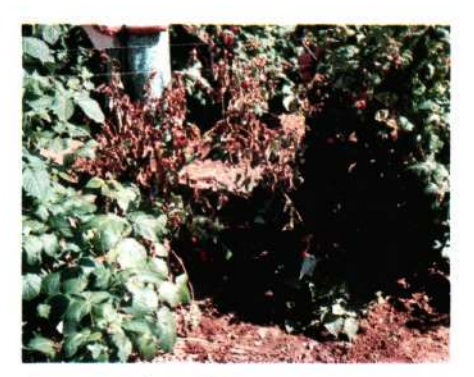
Figure 11. Phytophthora Root Rot can cause entire canes to wilt and die in mid-summer.

The bacteria of crown and cane gall (Agrobacterium spp.) cause galls on roots (Fig. 12) or on canes. Infected bushes become weakened, stunted or unproductive as a result of the gall tissue interfering with water and nutrient