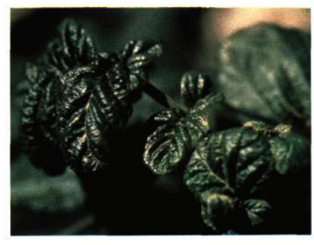
Figure 2. Leaves are rounded, curl downward and dark green in color with Raspberry Leaf Curl Virus infection.

a general stunting of the bush, a general yellowing of leaves (Fig. 4) and production of small, crumbly fruit. Virtually all raspberry varieties are susceptible. Tomato ringspot virus has a very wide host