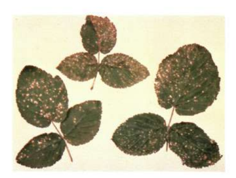
Figure 5b. Shot-hole appearance of leaves infected with Anthracnose.

inch in diameter (Fig. 5B). Diseased tissue frequently drops out leaving a "shot-hole" appearance. If the disease is not controlled, canes become cracked and the drupelets of the berries become infected, resulting in worthless fruit. The fungus survives the winter in infected canes and produces spores (both conidia and ascospores) in the spring at the time of leafing out. The disease can become serious with abundant rain in late spring and early summer, or under sprinkler irrigation.