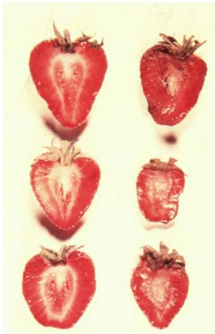
Fig. 6. Diseased fruit cap and beginning of berry infection from stem end rot. Note healthy berry at left center.

This disease causes a rot at the stem end of the strawberry fruit. The disease is caused by the fungus Dendrophoma obscurans which overwinters in plant debris on the ground. In early to mid-April, at about the time buds emerge from the crown, the fungus attacks the new leaves and causes the primary infection. Later, when fruit has formed, the calyx (fruit cap) becomes infected and instead of remaining green and healthy, turns brown. The fungus enters the fruit through the infected calyx, causing it to rot (Fig. 6). If uncontrolled, a considerable number of