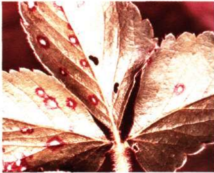
Fig. 10. Purple bordered tan spots found on leaves with leaf spot disease.

Control: Certain varieties are more resistant than others. The normal fungicide sprays applied to control fruit rots will usually control leaf spot. However, leaf spot disease can build up during the first year after planting if growers do not apply many fungicide sprays to