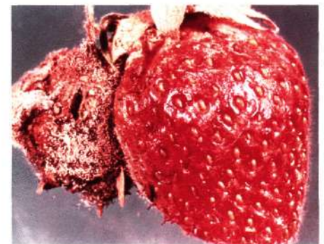
Fig. 5. Fuzzy spore masses on a Botrytis infected strawberry.

This disease is caused by the fungus, Botrytis cinerea , which overwinters on