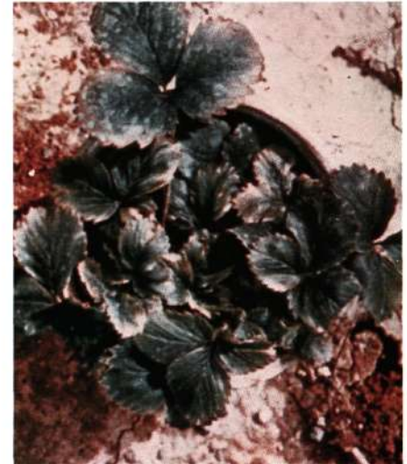
Fig. 11. Stunted and discolored leaves resulting from "June yellows" virus infection.

There are several virus diseases that can infect strawberries. Visible symptoms may not be evident in the plants. Plant vigor is generally affected, however, causing the plants to die when weather conditions become unfavorable. Visible symptoms can include leaf crinkling, variegation, cupping, and stunting. Plants showing these symptoms should be removed and destroyed. The predominant virus-like disease of strawberries in Michigan is "June Yellows" (Fig. 11). The main symptoms are stunting and yellowing of leaf margins.