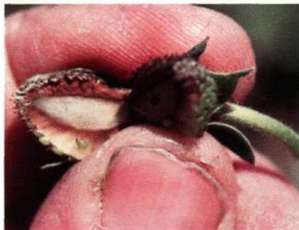
Fig. 7. Discolored vascular system with radiating brown streaks in a Phytophthora (leather rot) infected berry.

This disease is caused by the fungus Phytophthora cactorum . This disease can become very important in some years, given favorable environmental conditions. Ripening fruit clusters that are touching the ground in standing water after prolonged warm rains suddenly (in a day or two) turn grey-brown and become mushy. The fruit stems often become rotted. The disease progresses rapidly and a rotten smell pervades the field. After a few days, infected berries start to dry out and become leathery. If infected berries are cut longitudinally, the vascular system of the fruit is