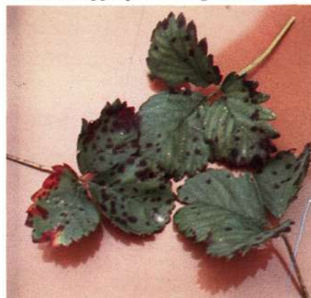
Fig. 8. Purple spotted leaves typical of leaf scorch disease.

Control: Plant resistant varieties. Remove and destroy leaves after fruit-bearing. The grey mold/stem end rot fungicide program will usually control scorch. Consult Extension Bulletin E-154 for appropriate fungicides.