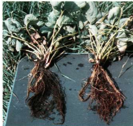
Fig. 4. Darkened roots from black root rot. Note the white feeder roots at the crown of the plant.

plant debris on the ground. Rainy or humid periods favor disease development. At the beginning of bloom, the fungus attacks the blossoms and causes a blossom blight leading to considerable crop loss. Fungus spores form on the blighted blossoms and infection spreads to both green developing fruit and ripening fruit. The disease first appears on fruit as small, water-soaked areas which are soon covered with grey, fuzzy-spore masses (Fig. 5).