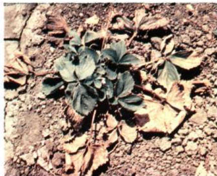
Fig. 1. Verticillium wilt-diseased strawberry plant.

The fungus ( Verticillium albo-atrum ) that causes Verticillium wilt can be very damaging to strawberry plantings. Several common garden crops (tomatoes, potatoes, peppers, eggplants) and some woody ornamentals are also susceptible to this disease. The fungus can survive in the soil for many years. Wounds are not necessary for