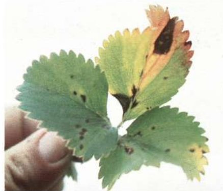
Fig. 9. Leaf spots and larger lesions along veins caused by leaf blight disease.

This disease is caused by the fungus Mycosphaerella fragariae . The fungus overwinters on old, infected, strawberry leaves. In the spring, the pathogen attacks young leaves, leaf stalks, calyxes (caps) and stolons. Infection is favored by cool, wet weather. Leaf spots are circular and 1/8 to 1/4 inch in diameter (Fig. 10). The center of the lesion or spot