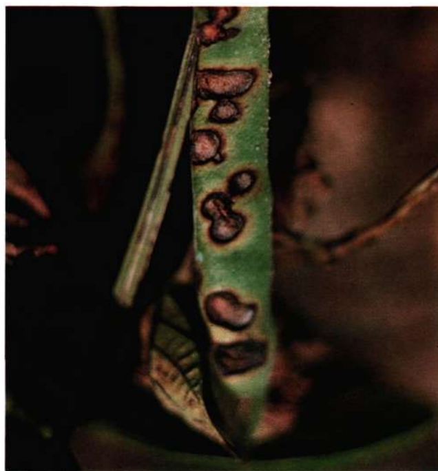
Figure 4. Pink to flesh colored spores appear in the center of the lesions.