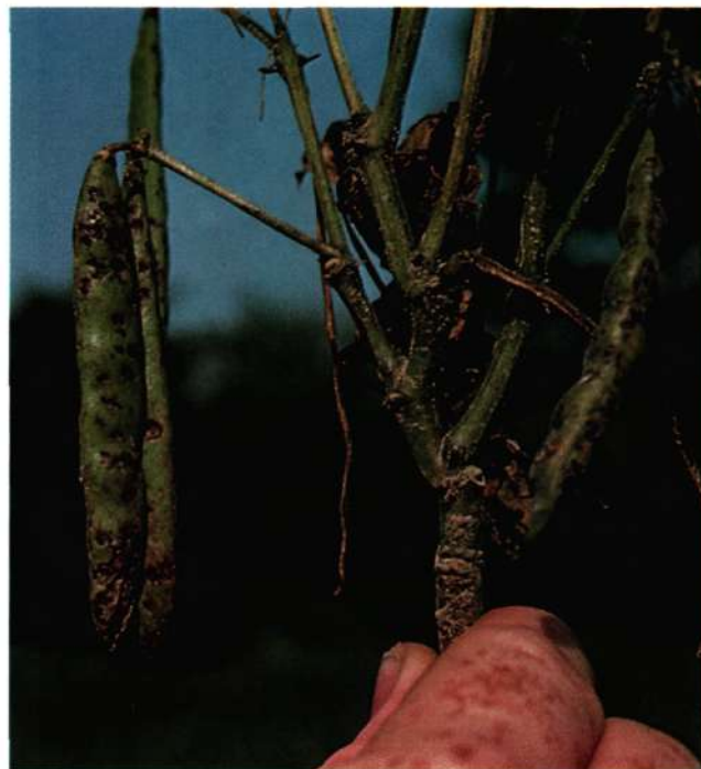
Figure 3. Severe and early infection leads to defoliation and typical pod symptoms.

R = Resistant — No or very little disease