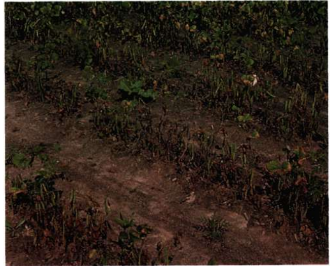
Figure 1. An area of a field severely infected with the anthracnose fungus.

Symptoms of pod infection by C. lindemuthianum are very distinct and appear as circular, reddish-brown to near black lesions on the pods (Fig. 3). The spots develop a sunken center as the lesions enlarge. The center first shows brown, dead tissues which are quickly replaced by pink to flesh colored fruiting structures which contain spores of the fungus (Fig. 4). The fungus may penetrate through the pod wall causing discoloration and distortion of the seeds. At this stage of disease development the fungus can also penetrate the seed coat and become firmly established within the seed. Such infected seeds, when planted, serve as the source of infection for succeeding crops. Infected seed serves as the primary source of inoculum since the fungus infrequently overwinters in Michigan soils.