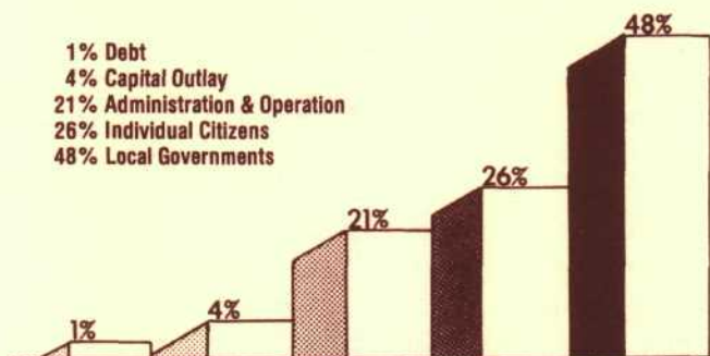
Figure 2 — Distribution of state funds (1981).

requiring the state to return 41.6% of the total adjusted state budget to local governments. The money is returned in the form of state revenue sharing, school aid, courts, mental health, roads, etc.