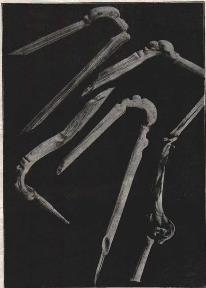
Fig. 3.—Work of the less common but more destructive joint-worm ( I. vaginicola ).