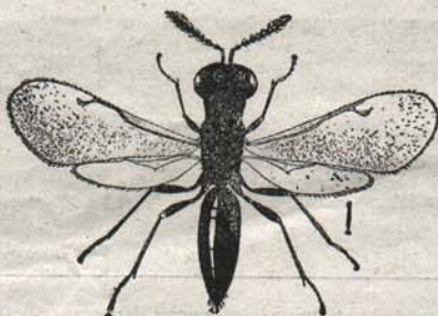
Fig. 1.—Wheat joint-worm, much enlarged. (After Maraltt, Farmers' Bulletin 132, Bureau of Ent. U. S. Dept. of Agr.)

Early in the present season it was discovered that the joint-worm, Isosoma tritici , was present in large numbers in Michigan wheat. Later developments show that another species, Isosoma vaginicola , more destructive than the common wheat joint-worm, is also present in restricted areas. The work of the joint-worm is almost universally confused, by the grower, with that of the Hessian fly. Both the joint-worm and Hessian fly cause wheat to lodge or go down, although in the case of the joint-worm a much smaller percentage of infested straws lodge than in the case of the "fly". The insect works primarily in wheat, although it is found also in rye, barley, and some grasses, the damage to wheat being anywhere from less than one per cent up to almost total infestation. The damage to rye is usually merely nominal except that sometimes volunteer rye may suffer quite severely. The damage done by the common wheat joint-worm is usually limited to the lodging of part of the plants and to shriveling of the wheat berry itself. The grain that is lodged is of course, lost to the reaper and the berries fail to fill properly, that is, they do not plump up well. Fortunately, outbreaks of joint-worm in the past have come to Michigan only at long intervals, periods of from ten to twenty years usually elapsing between serious invasions. In the meantime it is held in check by its own set of parasites which normally