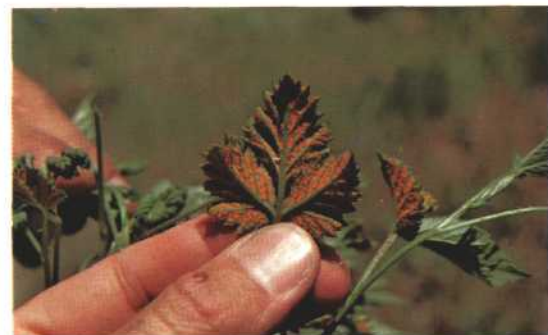
30. RUST: A disease giving a "rusty" appearance to a plant and characterized by dense masses of reddish-brown to orange spots on leaves and other plant parts. Orange rust on brambles.