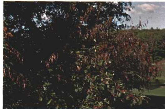
11. DIEBACK: Progressive death of branches or shoots beginning at the tips and moving toward the main stem or trunk. Usually associated with woody plants. Fireblight on crabapple.