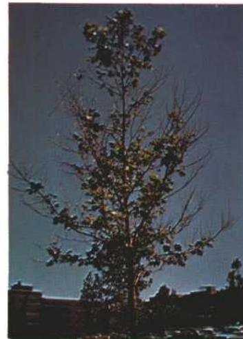
18. LEAF OR NEEDLE DROP: An untimely and uncommonly large loss of needles or leaves. Anthracnose on sycamore.