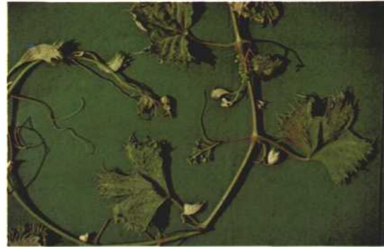
16. HERBICIDE INJURY: Gross leaf distortion. 2, 4-D injury on grape.