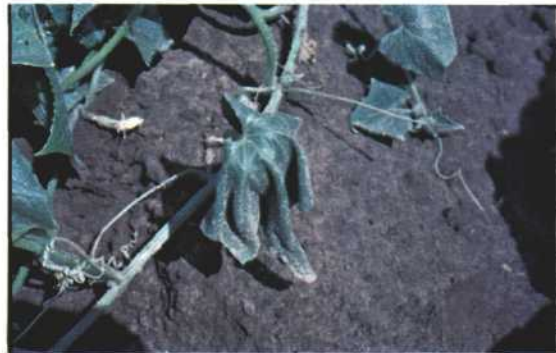
34. WILTING: Loss of freshness and rigidity, and drooping of plants due to insufficient water in the plant. Cucumber wilt.

COVER: Apple scab caused by venturia inaequalis .