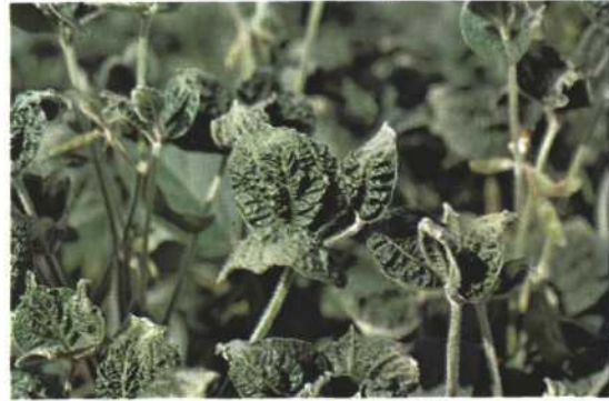
28. RUGOSITY: Wrinkling, ridging or puckering of normally flat leaves. Virus symptoms on soybean.