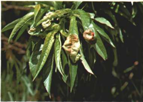
08. CURLING: Abnormal bending of leaves from the unequal development of its two sides. Peach leaf curl.