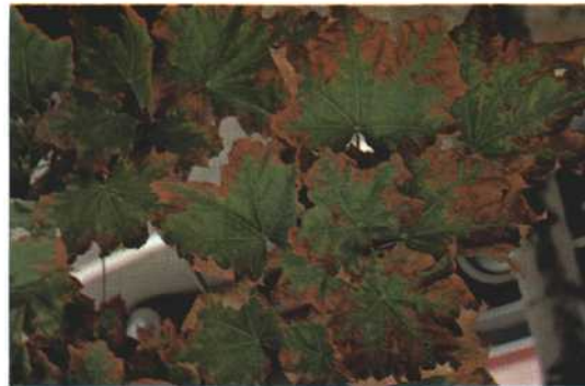
23. MARGINAL NECROSIS (scorch): Burning or dying and browning of leaf margins. Usually results from unfavorable environmental conditions. Scorch symptoms on maple.