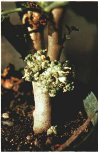
13. PROLIFERATION: Excessive development of secondary roots or stems around a main root or stem. Marked dwarfing may be associated with shortened internodes of stems. Fasciation of geranium.