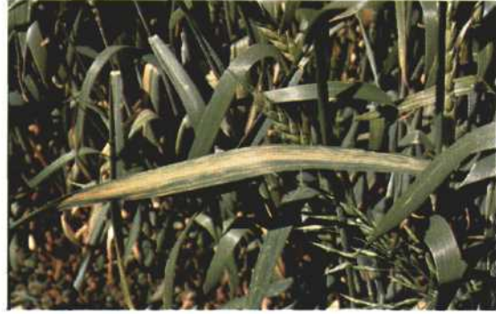
33. STREAK (stripe): Narrow, elongate areas on leaves characterized by yellowing or necrosis of the affected area. Wheat streak virus on wheat.