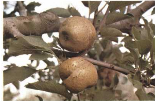
29. RUSSETTING: Brownish roughened areas on the skin of a fruit or tuber as a result of cork formation. Russett of Golden Delicious apple.