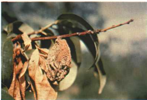
21. MUMMIFICATION: Darkening, wrinkling, hardening of rotted fruit. Results from a rapid loss of moisture from the fruit. Brown rot of peach.