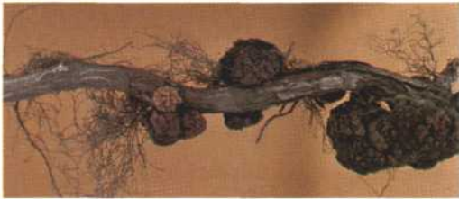
14. GALL: A more or less spherical overgrowth or swelling of unorganized plant cells, usually the result of attack by insects, bacteria, fungi, or nematodes. Root crown gall on euonymus, stem crown gall in rose.