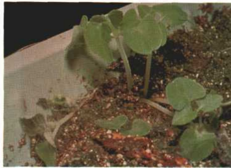
10. DAMPING OFF (Post-emergence): Rapid rotting of the stems of seedlings at the soil line or the rotting of the root system after their vegetative growth above-ground is established. Damping off of impatiens.