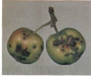
31. SCAB: A roughened, crust-like diseased area on the surface of a plant organ. Potato scab, apple scab.