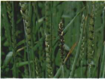
32. SMUT: A disease caused by smut fungi and characterized by masses of brown to black powdery spores. Loose smut in wheat, corn smut.