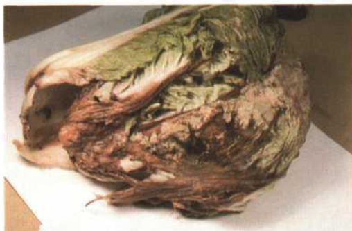
27. ROT: Disintegration, discoloration, and decomposition of plant tissue. A dry or hard rot if the decay is firm and dry; or a wet rot if soft, watery and foul smelling. Soft rot of lettuce and blossom end rot in tomato.