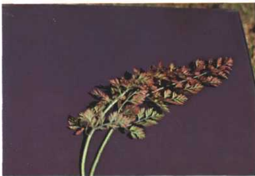
26. REDDENING (purpling): Reddish or purplish discoloration of leaves or other organs which are normally green. May be a localized or general symptom. Aster yellows on carrot.