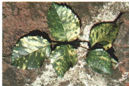
24. MOSAIC: Variegated patterns of shades of greens and yellows in normally green leaves. Also characterized by intermingled patches of normal and light green or yellowish color. A common symptom of many viruses. Rose Mosaic Virus.