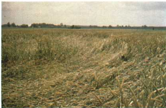
20. LODGING: Falling over of plants at the base, usually associated with root rots. Wind damage on wheat.