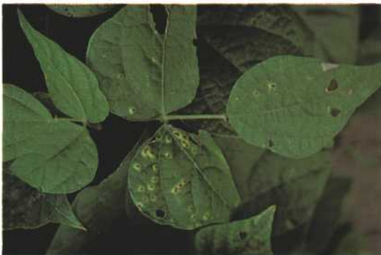
15. HALO: A spot on a leaf surrounded by a discolored (usually yellow) circle. Bean rust.