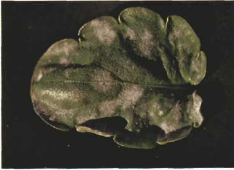
25. POWDERY MILDEW: Whitish growth on plant surfaces, usually the leaf or stem. Cotton-like in appearance, initially occurs in spots. Powdery mildew on pansy.