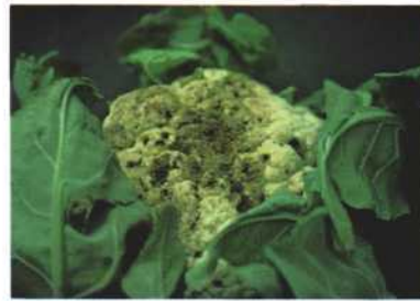
22. NECROSIS: Dead tissue or plant parts. Alternaria on cauliflower. Downy mildew on cabbage.