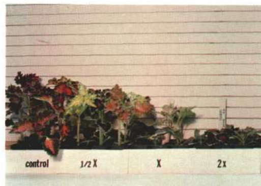
12. DWARFING (stunting): Subnormal size of plant or some of its organs. Dwarfing from excess fungicide on coleus.