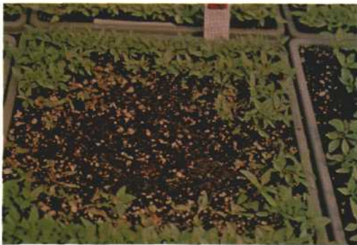
09. DAMPING OFF (Pre-emergence): A rapid rotting of the base of the stems or seedlings after germination but before the seedling breaks the soil surface. Damping off of impatiens.