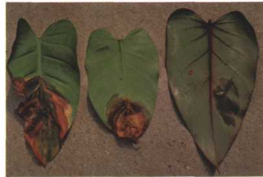
17. HYDROSIS (water soaking): A water-soaked appearance caused by the movement of water from cells into spaces between the cells; a common symptom during early stages of many bacterial diseases. X. dieffenbachia on dieffenbachia.