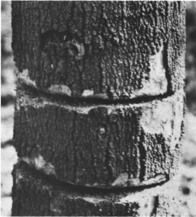
Fig. 6. A chain saw girdle is a simple way to remove unwanted trees from a woodlot.

located just beneath the bark) completely around the tree to insure a complete kill. A girdled tree dies slowly, and later, comes down in pieces, thereby doing less damage to the residual stand. However, girdled, dead standing trees may pose a hazard to people using the woodlot for hunting, hiking or other recreational purposes. Stump-sprouting from girdled trees is not a serious problem for northern hardwood species, especially trees over 10 inches in diameter. Girdling may be accomplished by using an ax or chain saw.