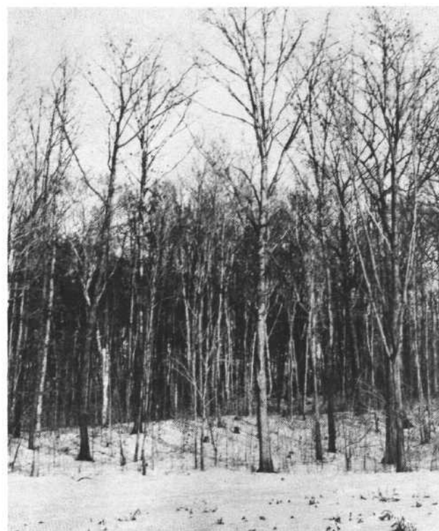
Fig. 1. Many hardwood timber stands in Michigan have not been managed as a renewable crop and are in need of an improvement and/or thinning operation.

Most hardwood timber stands will benefit from a timber stand improvement treatment. Timber stand improvement (TSI) is a conscious effort made in a forest stand to improve future growth and quality. This practice is applicable to woodlots which have grown past the sapling stage with trees more than 4 inches in diameter at breast height (dbh). After a TSI program, the growth potential of a given site will be concentrated on trees of potentially high quality and value. TSI can also have positive wildlife and environmental effects. However, the principal objective is to encourage a stand of high quality trees which will grow more rapidly than if left untreated.