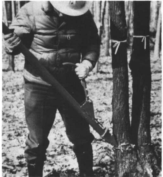
Fig. 7. Herbicides can be injected directly into the tree through use of appropriate specialized equipment.

The use of herbicides to kill unwanted trees probably represents the fastest and easiest way to improve hardwood timber stands. Chemical thinning is ac-