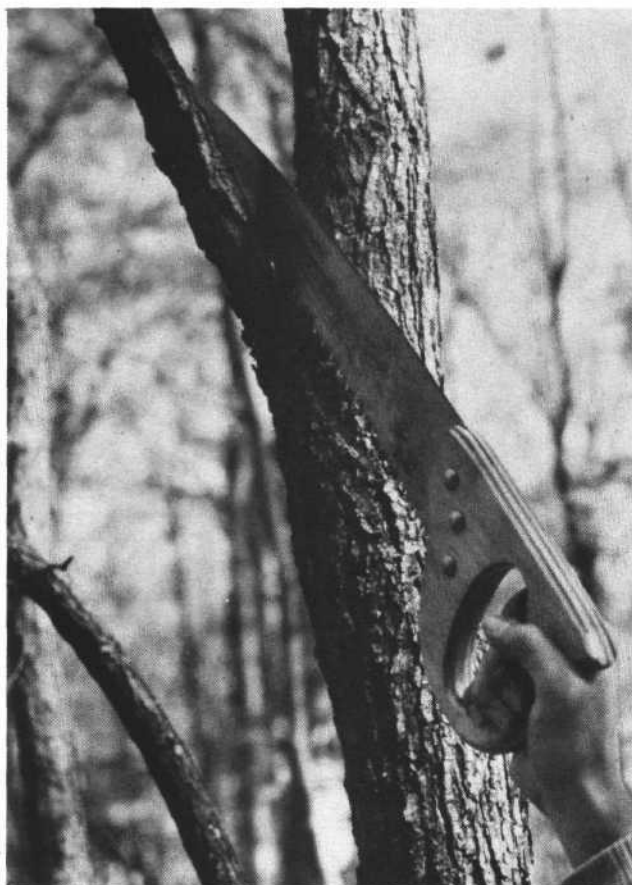
Fig. 8. Careful pruning will encourage rapid healing and increase bole quality.

The suggested TSI practices are not difficult to implement. Once the woodlot owner can properly identify tree species and select desirable trees with proper form, he can usually complete a TSI or thinning program on his own. Implementing such a program is an excellent means of obtaining fuelwood while improving the condition of the woodlot. Where