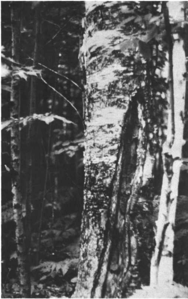
Fig. 2. Low value, cull trees should be removed to allow desirable trees to grow more rapidly. This removed material is an excellent source of firewood.

least 40 crop trees per acre, although in most stands considerably more will be selected. This low stocking level is particularly acceptable if high-value species, such as black cherry, black walnut or yellow birch are present. The maximum number of selected crop trees will vary for each stand depending on the size of the trees present, site conditions and potential market for products removed in improvement cuttings and thinnings. For example, fewer crop trees will be selected in a stand with an average diameter of 12 inches than in a stand with a 6-inch average diameter. Likewise, more trees can be selected per acre if the stand is growing on well-drained, productive soil than if growing on droughty sites or infertile soils. If a market is available for products removed in improvement cuttings and thinnings, a few extra crop trees may be retained when initial selections are made. In later years, these can be removed in successive thinnings. In such cuts, efforts are directed toward increasing the quality of the residual stand.