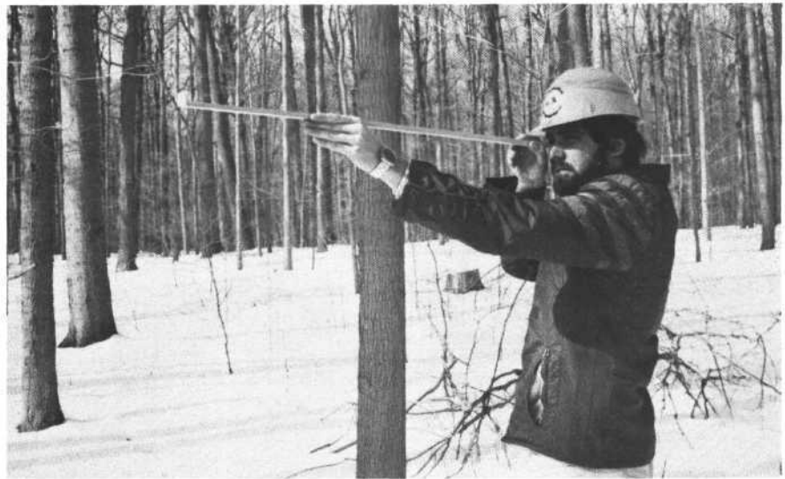
Fig. 4. To estimate basal area using an angle gauge, the observer turns a complete circle over the sampling point and counts the total number of trees larger than the width of the block.

sampling is a quick method of estimating tree basal area per acre without actually laying out sample (area) plots, measuring tree diameters and converting to basal area. Rather, only representative sampling "points" or plot centers are selected in a woodlot. Estimates of basal area, using an angle gauge or wedge prism are taken directly above the established points. To obtain an accurate estimate of basal area per acre, however, it is important that several uniformly scattered "points" or plot centers be established and sample estimates taken with the results averaged.