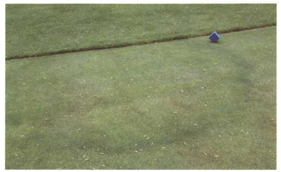
Figure 2: Fairy ring may not kill turf, but can cause yellowing and stunting to occur.