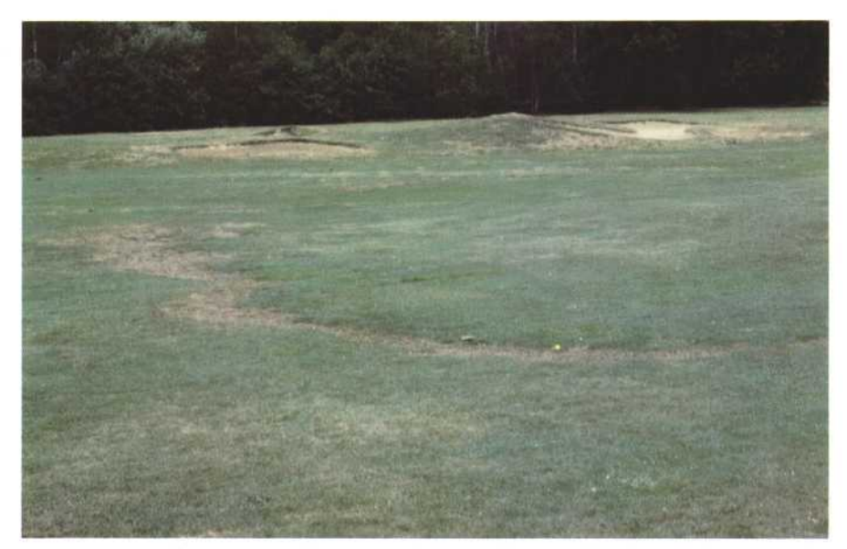
Figure 1: A characteristic fairy ring showing the stimulated growth area and deadened region at the outer edge.

A circular fairy ring develops because the fungi starts out from a central point and grows equally in all directions. The fungi break down the organic matter as they grow, releasing nitrogen (ammonia) that eventually is changed by other microorganisms to nitrate nitrogen. The nitrate nitrogen stimulates turfgrass growth within the ring (known as the zone of stimulation or activity zone). Turf may first appear dark green, but will eventually die if stressed by heat or drought (Fig. 1). Sometimes the turf may simply turn yellow or be stunted (Fig. 2). If the turf is adequately watered it usually will recover from the vellowing, but the stunting may remain. The yellowing, stunting and turf death within the ring has been attributed to a number of causes. Mushrooms are often found in the