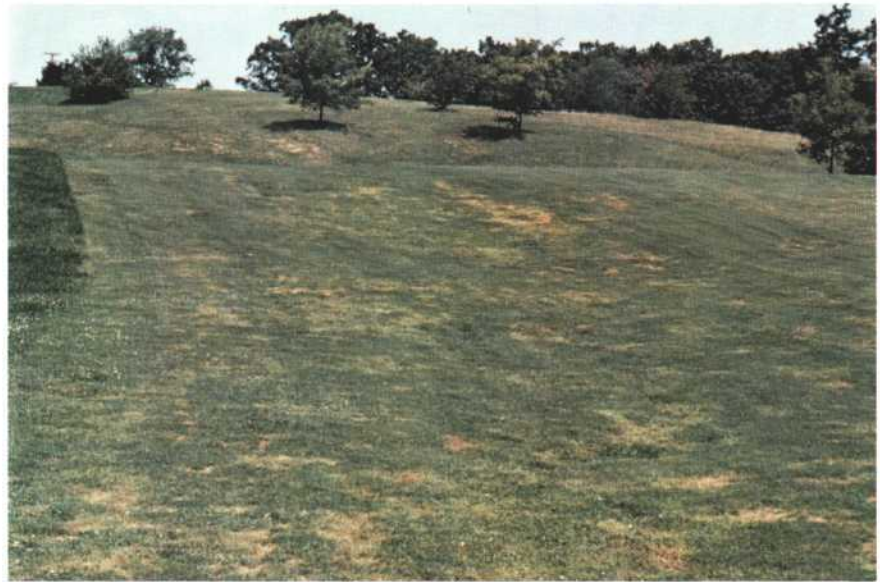
Figure 1: HAS decline damage on an annual bluegrass fairway.

In cool weather, the turf will remain yellow, with little thinning or dying. But when temperatures range