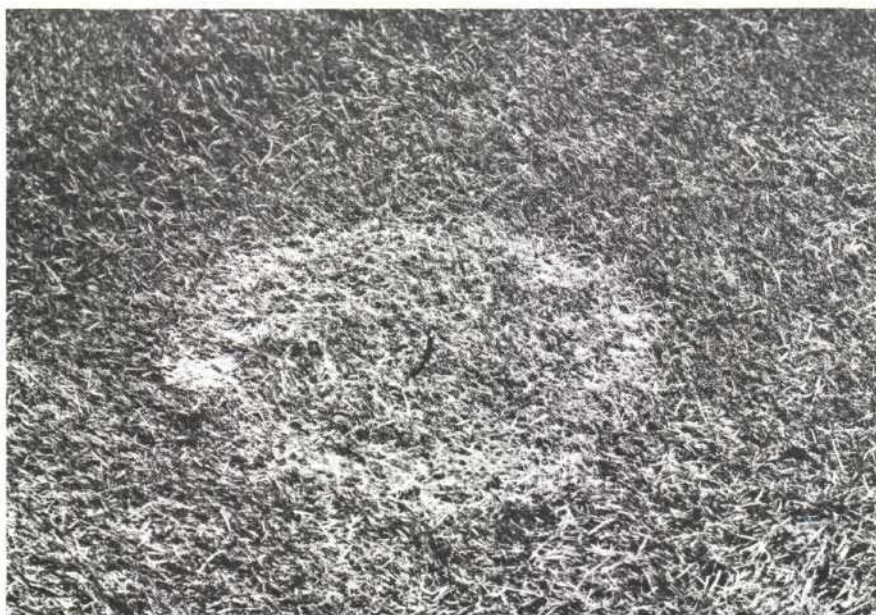
Figure 1. Brown, water-soaked areas will appear on infected turf once temperatures reach the necessary level.

R. solani survives the winter months in plant debris as mycelium and sclerotia. The fungus begins to grow as temperatures rise into the