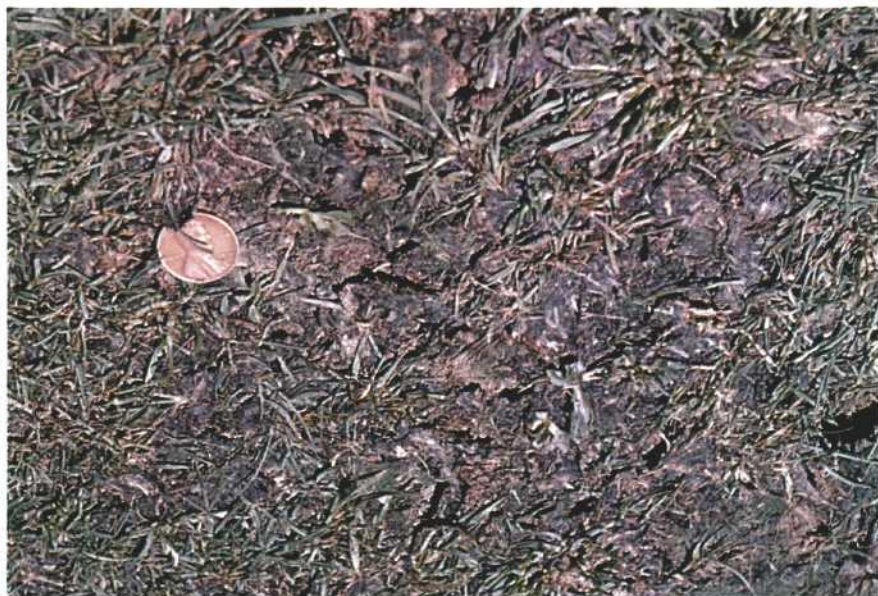
A heavy growth of algae can seal off the surface and severely restrict water infiltration. It will also smother grass.