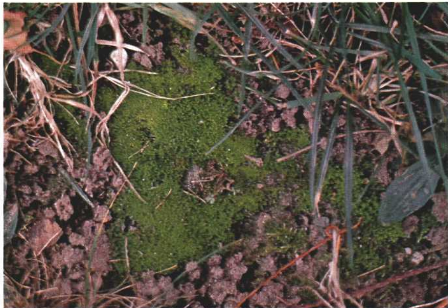
Moss in the lawn can be caused by a variety of conditions. To rid the lawn of the moss, determine which conditions are contributing to the problem.

For proper control, first determine which conditions are contributing to the moss infestation, then take the necessary steps to correct these problems. Low fertility areas can be fertilized to encourage aggressive growth of the grass to crowd out the moss. If acidic soil is suspected, a soil test should be made to determine the soil pH and obtain a specific recommendation for the area. Soil tests are available through your county Cooperative Extension