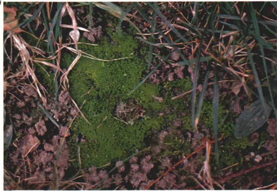
Moss in the lawn can be caused by a variety of conditions. To rid the lawn of the moss, determine which conditions are contributing to the problem.