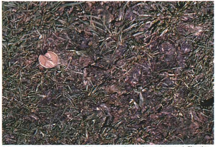
area. Soil tests are available through your county Cooperative Extension It will also smother grass. A heavy growth of algae can seal off the surface and severely restrict water infiltration. It will also smother grass.