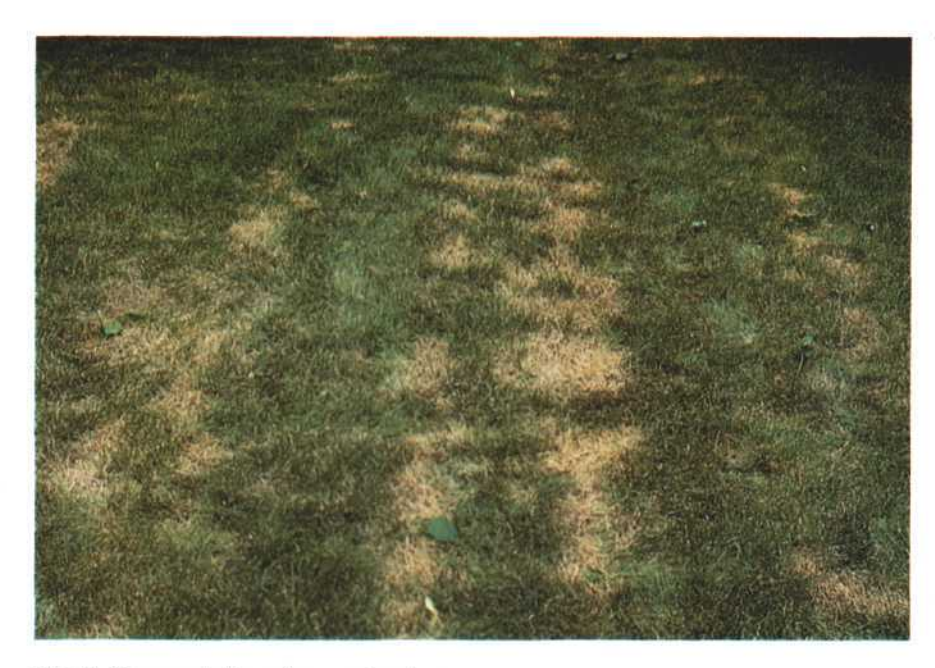
Fig. 3. Damage to lawn from sod webworms.