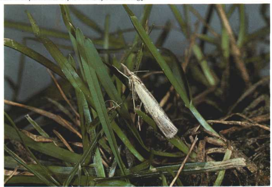
Fig. 1. Sod webworm adult.

Generally, if no feeding injury or larvae are found, the problem is likely due to some other agent, and insecticide applications will be useless.