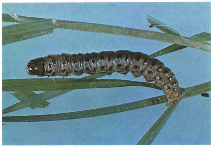
Fig. 2. Sod webworm larva.