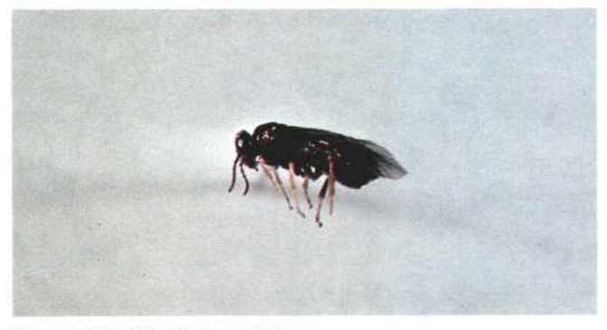
Figure 2. Birch leafminer adult.