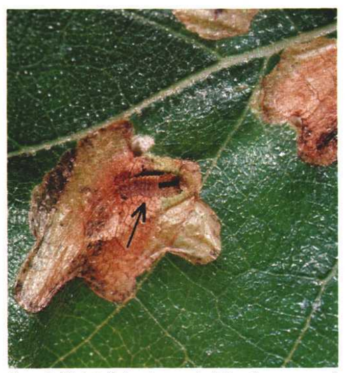
Figure 3. Birch leafminer larva, note flattened appearance of larva.

TREE IMPACT: Tree mortality from birch leafminer is rare in ornamental plantings. However, heavy attack by this miner puts severe stress on the tree by reducing the leaf area available for photosynthesis. Birches under such stress are probably more susceptible to attack by other insects, especially bronze birch borer, and disease.