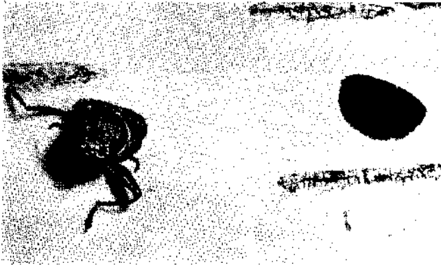
Figure 3. An emerging bronze birch borer adult (left) and the characteristic "D" shaped exit hole (1/4") of a previously emerged adult.

foundland to British Columbia, throughout the Lake States and as far south as Virginia and west to Arizona and New Mexico.