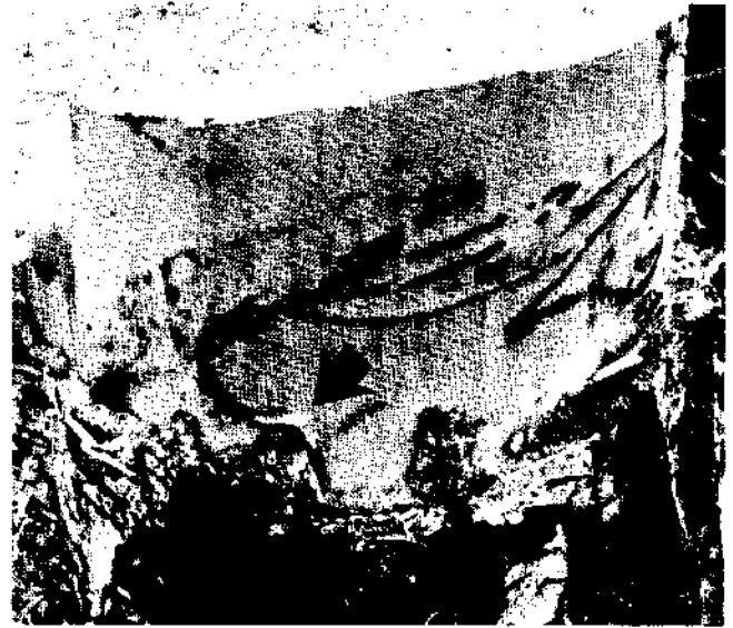
Figure 4. Bark removed from birch stump to reveal tunneling of birch borer larva (arrow).

The tunnels behind active feeding larvae become packed with excrement and wood particles which turn dark brown with age (Fig. 4). Most larvae mature by fall and construct oblong cells in the xylem just beneath the cambium or in thick bark. Pupation occurs in late April or early May of the