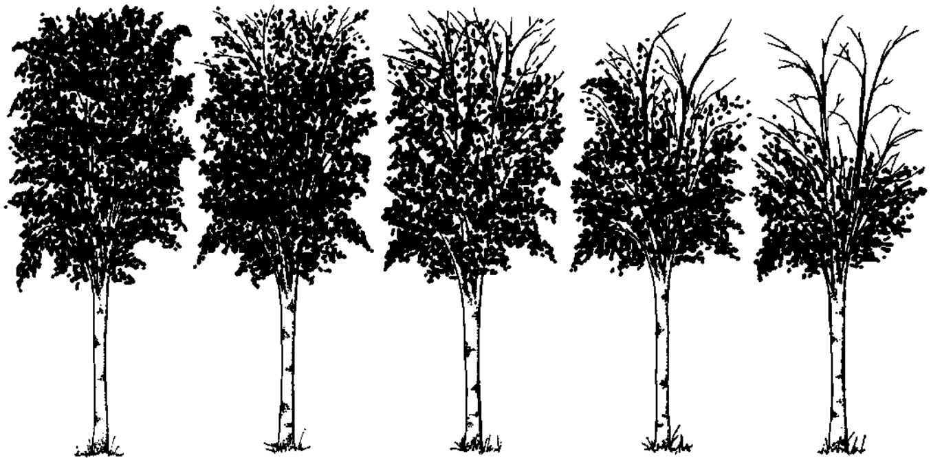
CLASS 1 A healthy, vigorous tree. Crown full with normal size, green foliage. CLASS 2 Scattered patches or flagging throughout top of crown. Dieback of several twigs. CLASS 3 Twig and small branch dieback. CLASS 4 Dieback of at least 3 branches 3 ft. long, however, not more than 1/2 of crown bare. CLASS 5 More than 1/2 of crown devoid of foliage, but crown contains at least several branches with foliage.

Figure 6. European white birch crown vigor classification and bronze birch borer attack. Trees in classes 2 and 3 may be treated for bronze birch borer with a moderate degree of success. Trees in classes 4 and 5 are generally beyond recovery and removal is suggested.