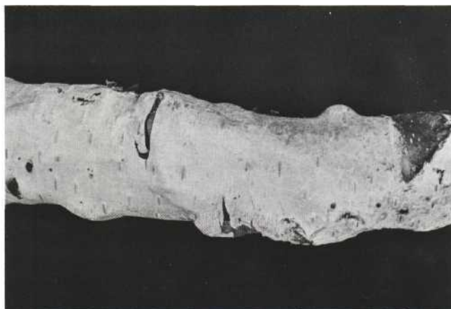
Figure 2. Vein-like swollen ridges in the bark of a branch caused by tunneling of bronze birch borer larvae.

Distribution: Bronze birch borer is a native insect which occurs throughout the range of birch in North America. It has been collected from New-