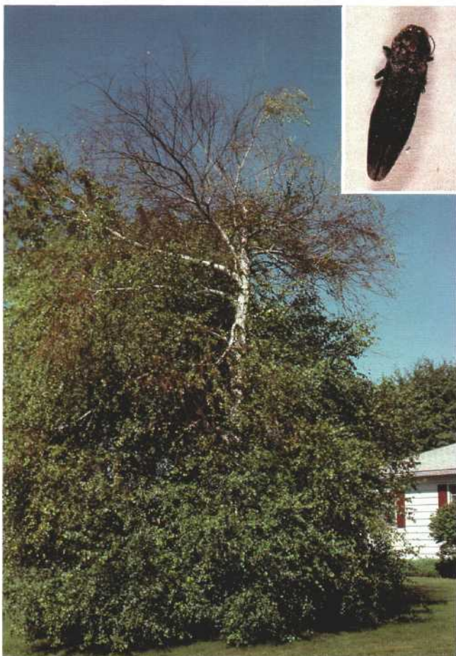
Figure 1. Dieback of upper crown due to bronze birch borer (inset). This is a class 4 tree, see Fig. 6.