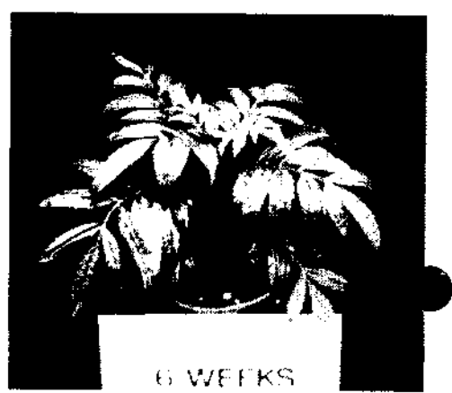
Six weeks after transplant.