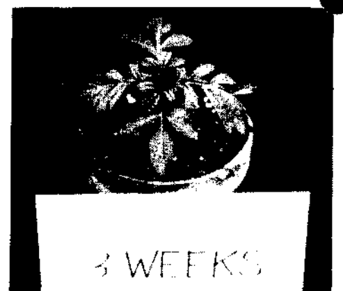
Three weeks after transplant.