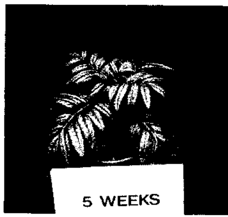
Five weeks after transplant.