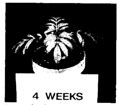
Four weeks after transplant.