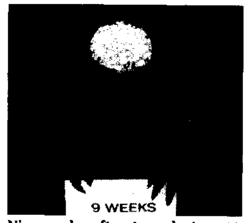
Nine weeks after transplant or 10 weeks from seeding (70 day old plant).