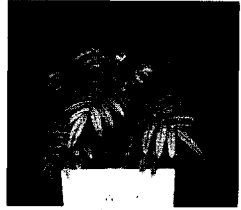
Seven weeks after transplant.