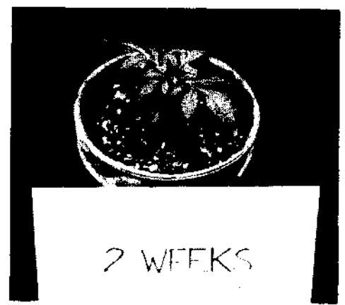
Two weeks after transplant.