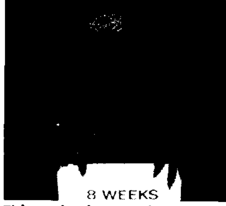
Eight weeks after transplant.