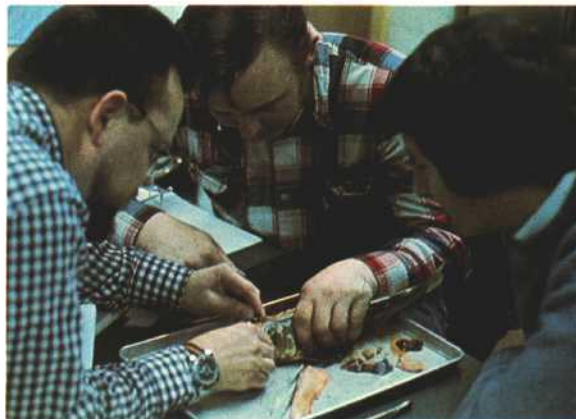
During an on-campus workshop, commercial fishermen and charterboat operators are shown how to examine fish to determine age and other characteristics.

A MARINA MANAGER'S CONFERENCE brings marina owners and employees from all