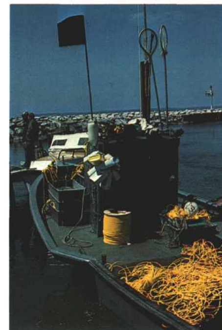
Marine Advisory Services helps commercial fishing operations by introducing new types of gear. Above, a fishing boat in Leland, Michigan with trap net.