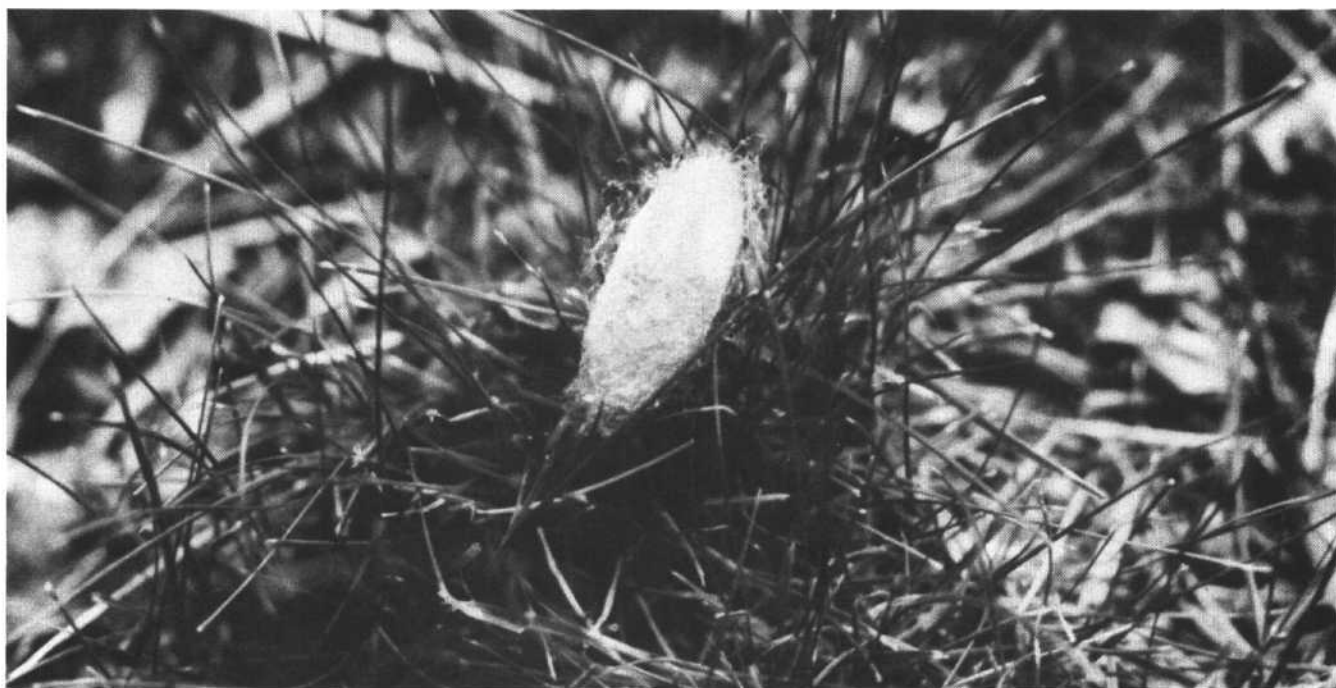
Pale yellow cocoon of the eastern tent caterpillar on tuft of grass (late May-early June).