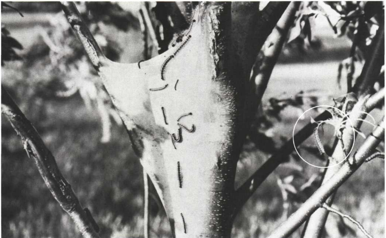
Eastern tent caterpillar in fork of tree (late April-late May) with caterpillars moving from tent to feed.

Eggs: ETC eggs are deposited in a band around small twigs or branches and covered with a foamy brown substance which hardens into a mass. The egg masses are 10-20 mm ( \frac{1}{2} - \frac{3}{4} " ) long with approximately 90 to 220 eggs per mass.