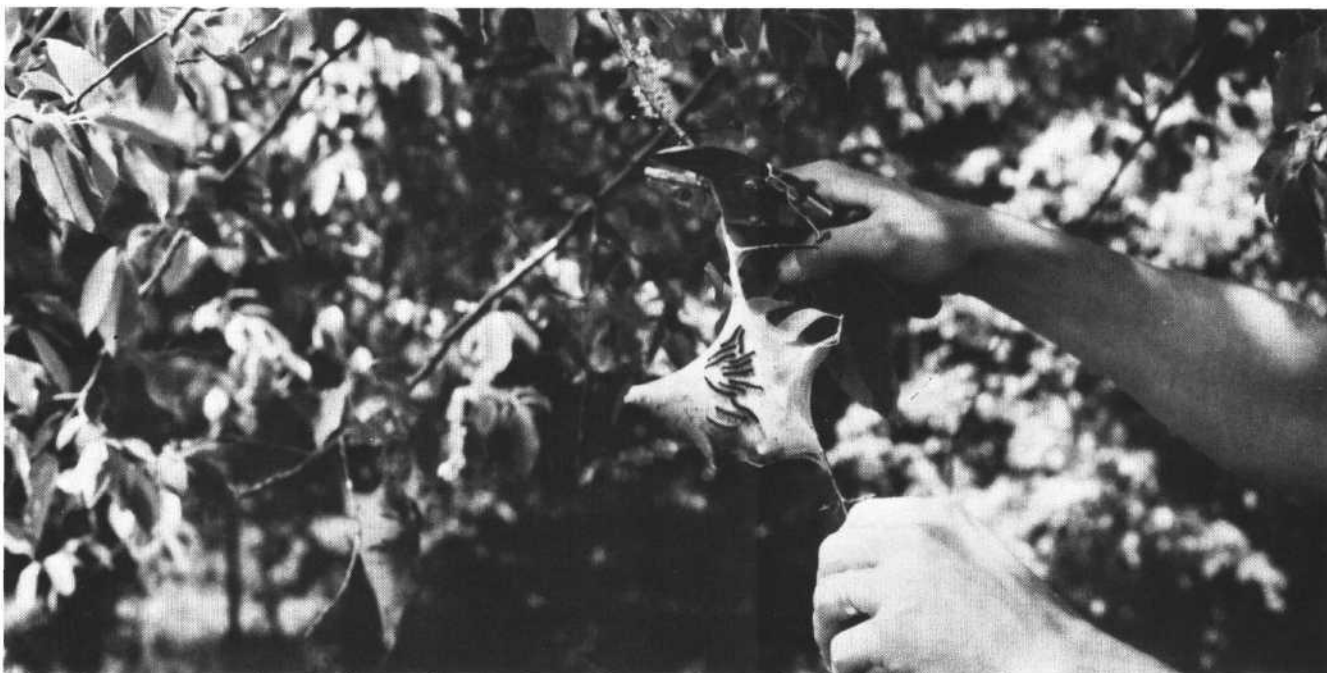
Small tents can be removed with pruning shears or by hand and destroyed.

MICHIGAN STATE UNIVERSITY ES COOPERATIVE EXTENSION SERVICE