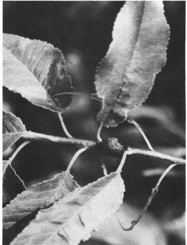
Egg mass on twig (mid-summer).

LIFE CYCLE. Eggs are laid on twigs in mid to late June and overwinter in this stage on the tree. Larvae hatch from the eggs at bud break in mid to late April (April 10-20) and immediately begin spinning a silken tent. The newly hatched larvae initially feed on opening buds and subsequently concentrate on the new foliage as it becomes available. Larvae leave the tent to feed at various times of the day returning only to rest. As larvae begin to mature at the end of May and early June, they leave the tent and seek out protected areas to form pale yellow cocoons. It is during this time that many people observe these large caterpillars wandering about their yards or climbing sides of buildings, fence posts, cars, etc. However, since little or no feeding occurs at this time, no controls are necessary. Adult moths emerge in 10-14 days to mate and lay eggs.