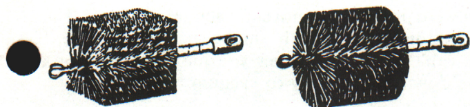
Square Chimney Brush Round Chimney Brush