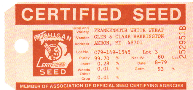
Figure 2. Certified seed tag for Frankenmuth wheat.

An application has been filed for Plant Variety Protection on Frankenmuth. Sale of seed by variety name is restricted to certified seed. Sale of uncertified seed