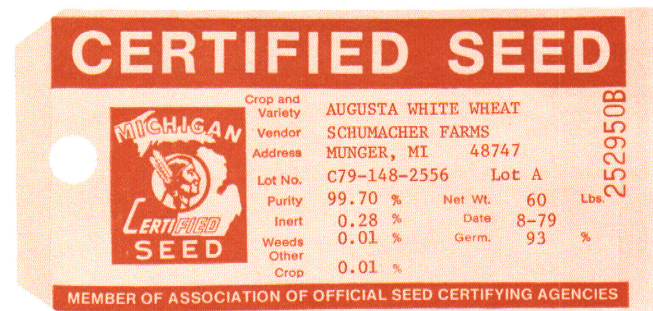
Figure 2. Certified seed tag for Augusta wheat.

An application has been filed for Plant Variety Protection on Augusta. Sale of uncertified seed by variety