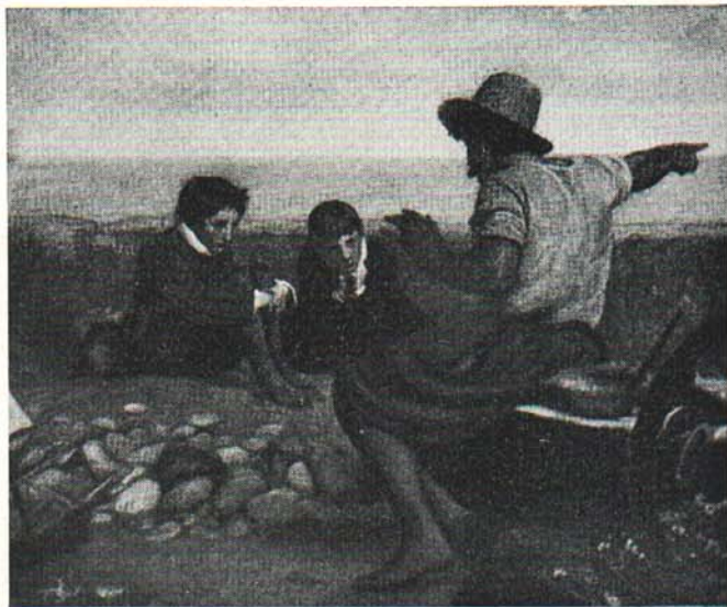
"Boyhood of Sir Walter Raleigh"—Millais

Another means of enjoying a picture is to see the beauty that the artist saw when he created it. Pictures are windows into the world of beauty that the artist knows. This beauty is often in color. When someone once said to the great artist Turner, that he had never seen such colors in nature, Turner replied, "Don't you wish you could?" A search for this same color in nature will be rewarded by the opening of a new world of beauty.