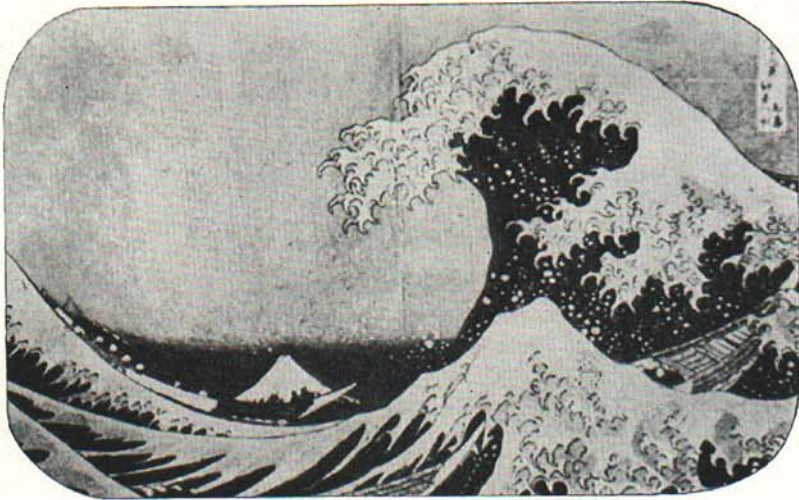
"The Great Wave"—Hokusai

Do not think of pictures merely as beautiful wall decoration, but choose those that make your surroundings happier and your ideals higher. Choose pictures that are worthy of continued notice. Use only a few pictures in a room at a time.