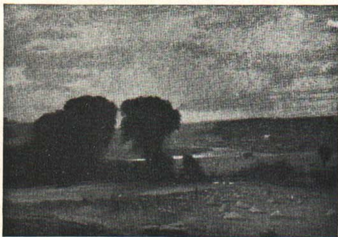
"Peace and Plenty"—Inness

The best decorative effects will be gained, if the pictures are chosen so that their size and shape will be similar to the size and shape of the wall space where they are to be hung. A horizontal, rectangular picture of considerable size is best suited to the space above a davenport which is against a long wall, or over a fireplace. Vertical flower panels may be hung in the narrow wall space on either side of a group of windows.