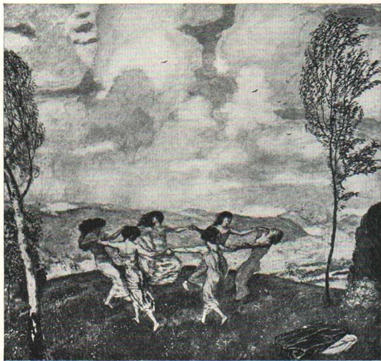
"Spring Dance"—Von Stuck

The Japanese, who have been trained to enjoy beautiful art, have an interesting method of using pictures in a room. Only one picture is used at a time and this one is given the place of honor. After a time, this picture is taken down and a different one used in its place.