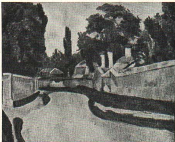
"The Village Road"—Cezanne

advantage if it is hung so that the center of interest in the picture is on the eye level of the person viewing it. This height is usually reckoned as being five feet three inches from the floor. The height for pictures in the child's room should be adjusted to the height of the child.