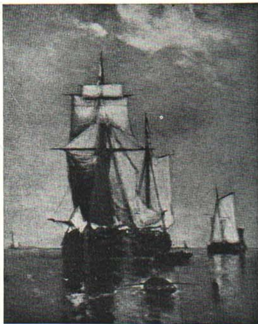
"In Holland Waters"—Clays