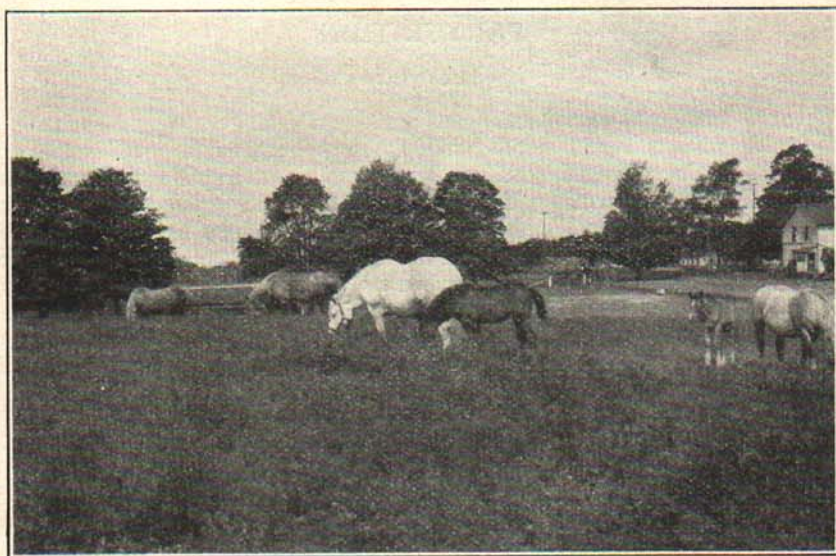
Fig. II. Mares and Foals in Alfalfa Pasture

Let the foal have the first milk to come from the mare's udder. It is nature's laxative which cleans the intestinal tract of the fecal discharges. If the bowels fail to discharge within four hours and the foal fails to take much nourishment, give an injection of luke warm, weak soapy water made with a vegetable soap, in which has been placed a few drops of glycerine, using for the injection a syringe with about a three-inch nipple. If constipation continues, give an ounce of castor oil in a small amount of the mare's milk. To do this, lay the colt on its side and pour the mixture into the corner of its mouth on top of its tongue, a swallow at a time. If the foal scours, restrict his diet by milking the mare out frequently.