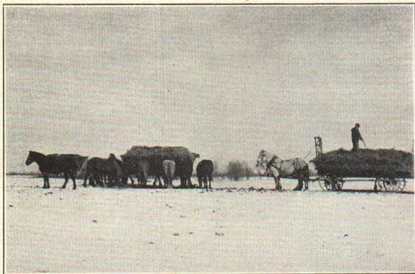
Fig. 1. Brood Mares in Winter

Dusty or moldy feeds should be avoided as they are often the cause of abortion. Beginning three or four months after the mare is settled, she should be given one ounce, three tablespoonfuls, of a solution made up of one-half ounce of potassium iodide in one pint of water on the feed once every week. Iodine is sometimes lacking in the feed produced in certain localities, and should, therefore, be provided in some other form as it is