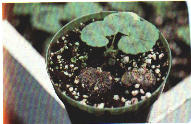
Figure 1. Dead leaf of geranium with heavy growth of Botrytis cinerea . From this tissue the fungus may invade healthy leaves or stems.

Under favorable moisture and temperature conditions, a beige-to-gray, fuzzy growth develops on