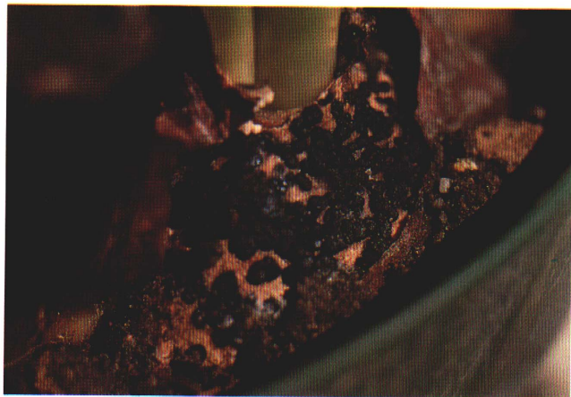
Figure 4. Bulb rot of tulip caused by Botrytis tulipae . Structures present are sclerotia (resistant survival structures) of the fungus.

The fungus must also have high humidity, 90-100%, or free water on the plant surface in order for spores to germinate and penetrate the host. Hence, warm weather with dew or rain or sprinkler irrigation is ideal for the development of gray mold diseases.